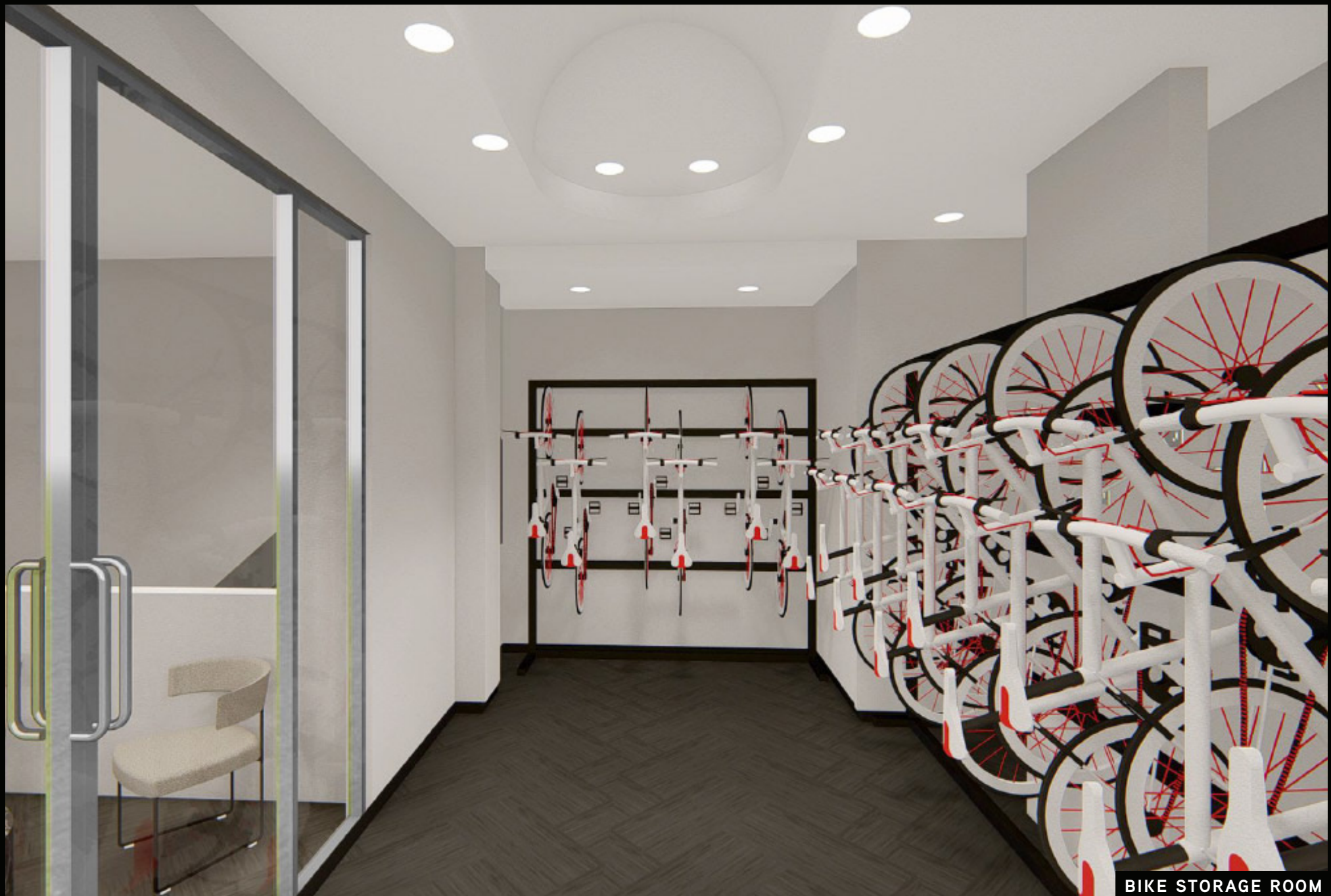
BIKE STORAGE ROOM