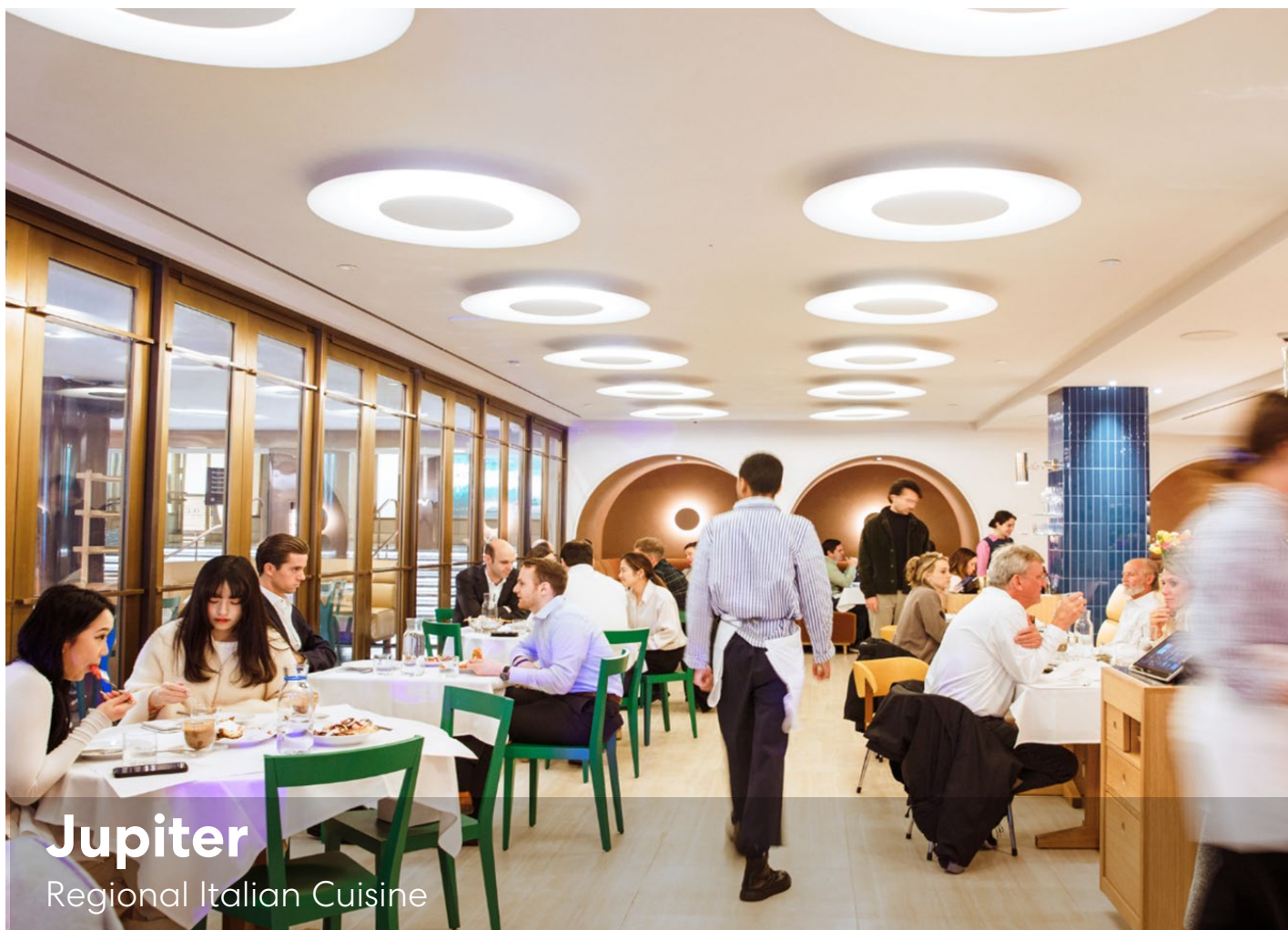
Jupiter Regional Italian Cuisine