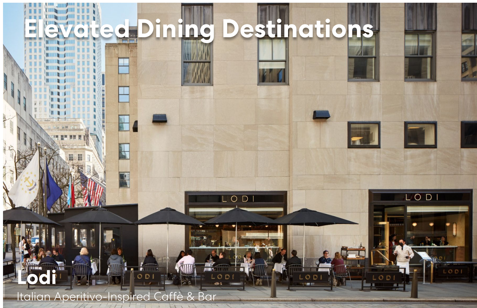
Lodi Italian Aperitivo-Inspired Caffè & Bar