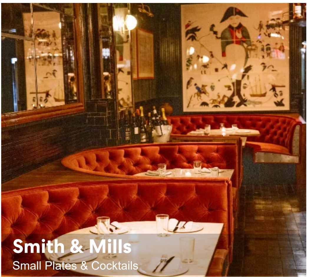
Smith & Mills Small Plates & Cocktails