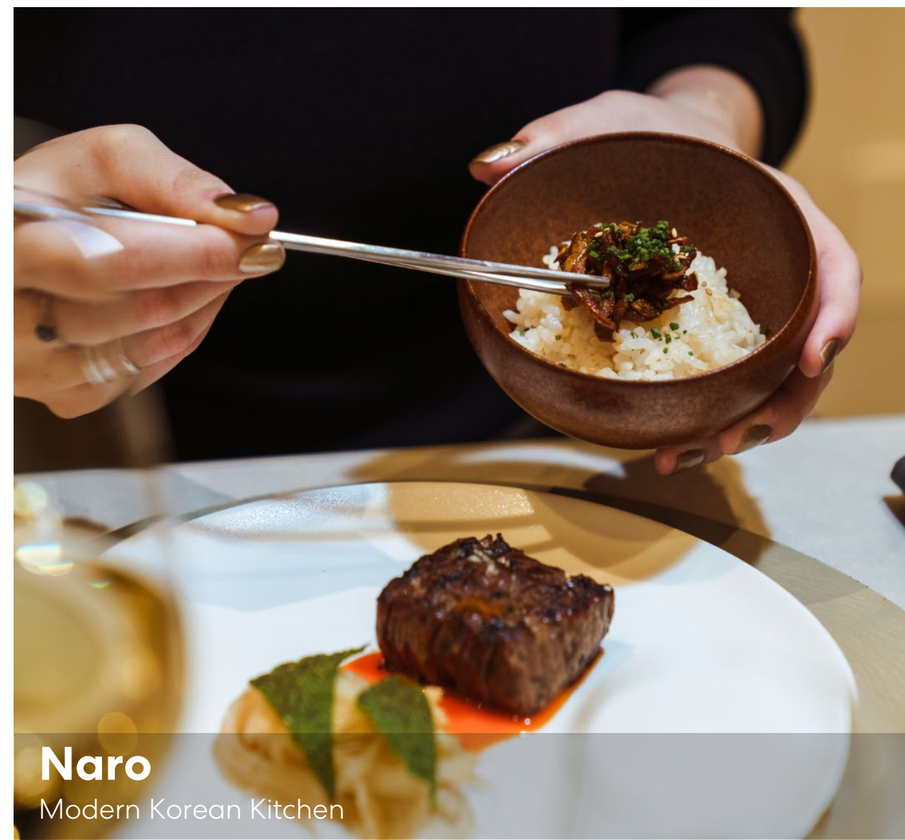
Naro Modern Korean Kitchen