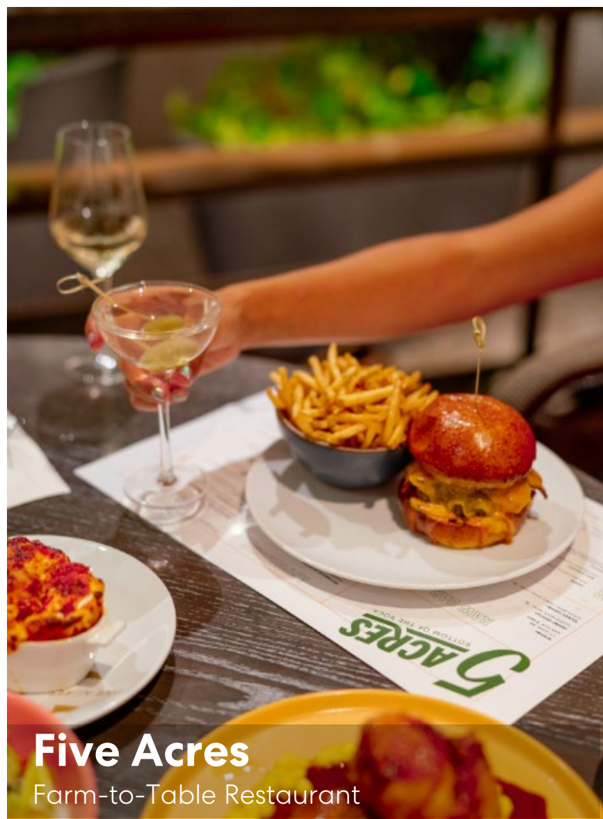
Five Acres Farm-to-Table Restaurant