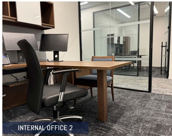
INTERNAL OFFICE 2