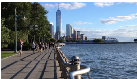
Hudson River Park