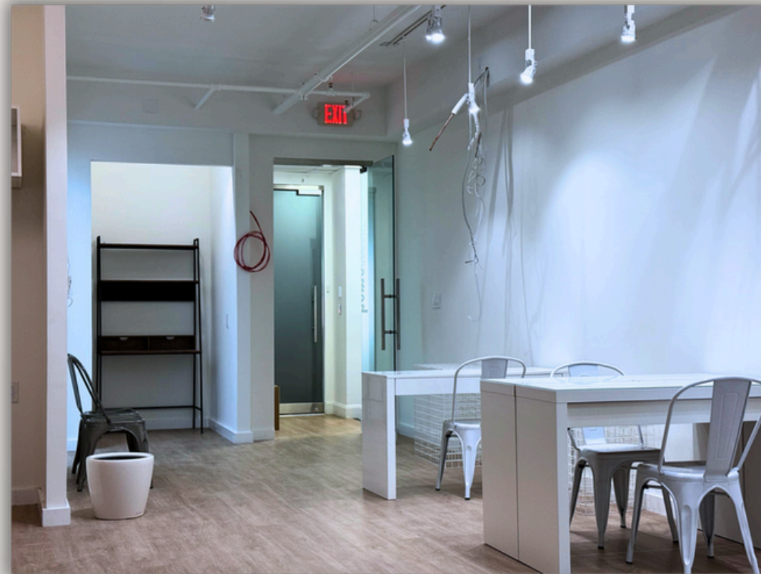
Open Desk Area/Showroom