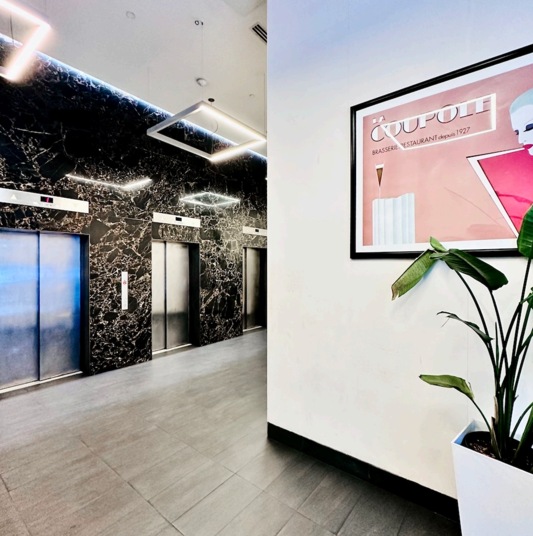
An attended lobby featuring a modern design and a professional staff, creating a welcoming and sophisticated atmosphere.