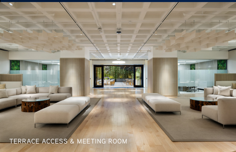
TERRACE ACCESS & MEETING ROOM