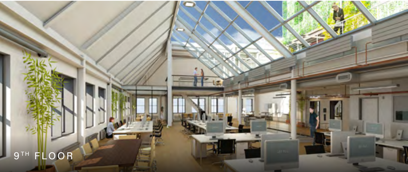
9 TH FLOOR