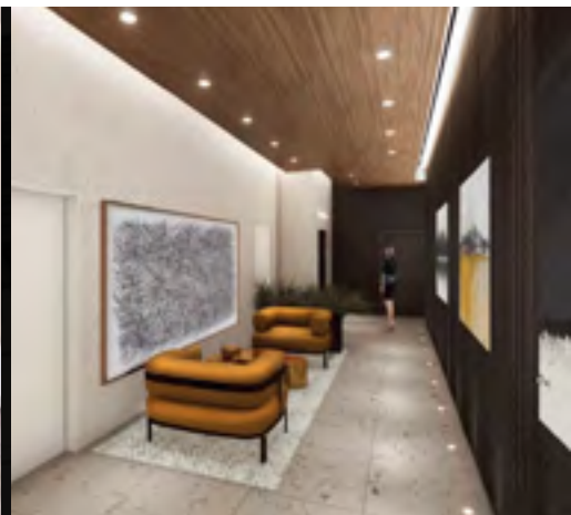
PRIVATE ENTRANCE RENDERING