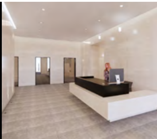
MAIN ENTRANCE LOBBY