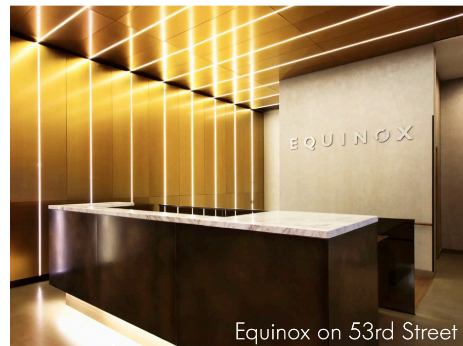
Equinox on 53rd Street