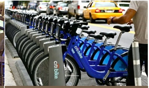
CitiBike Stations Nearby