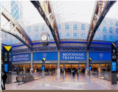
Moynihan Train Hall