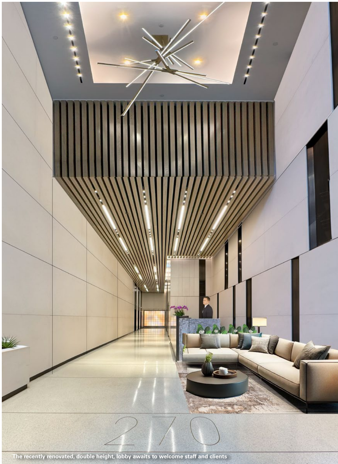
The recently renovated, double height, lobby awaits to welcome staff and clients