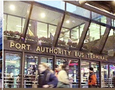
Port Authority Bus Terminal