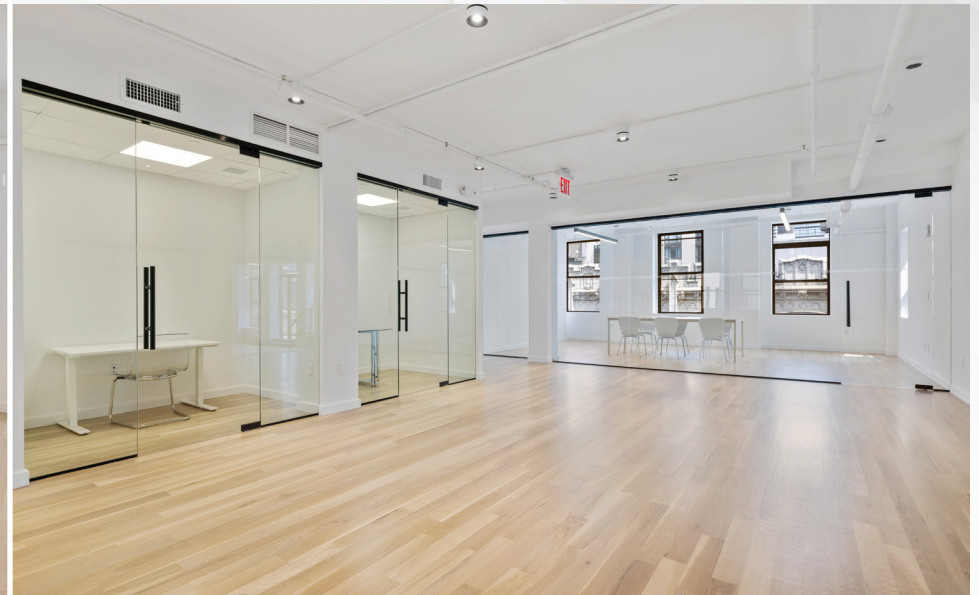
LARGE COLLABORATIVE PANTRY & AMPLE CONFERENCING