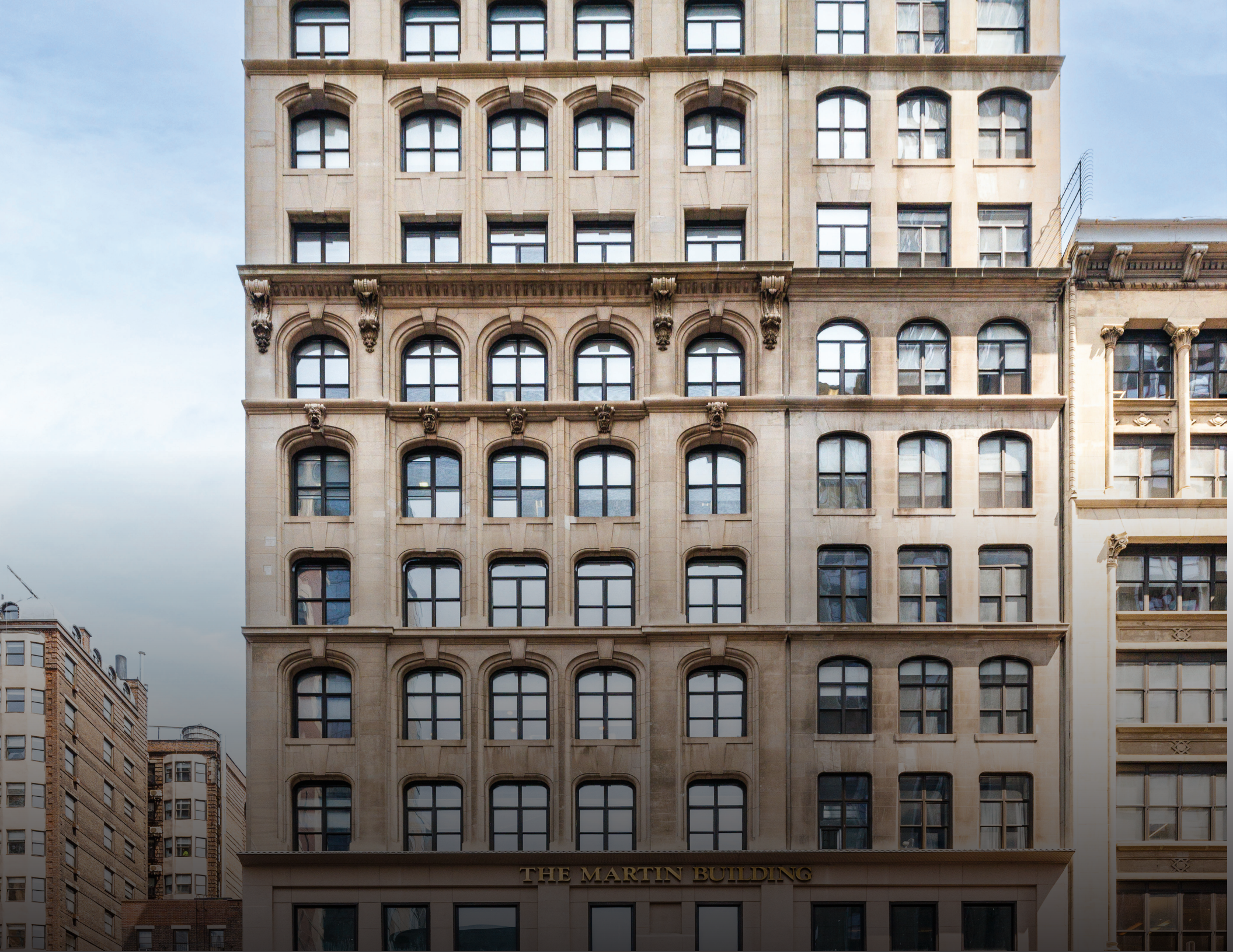
THE MARTIN BUILDING