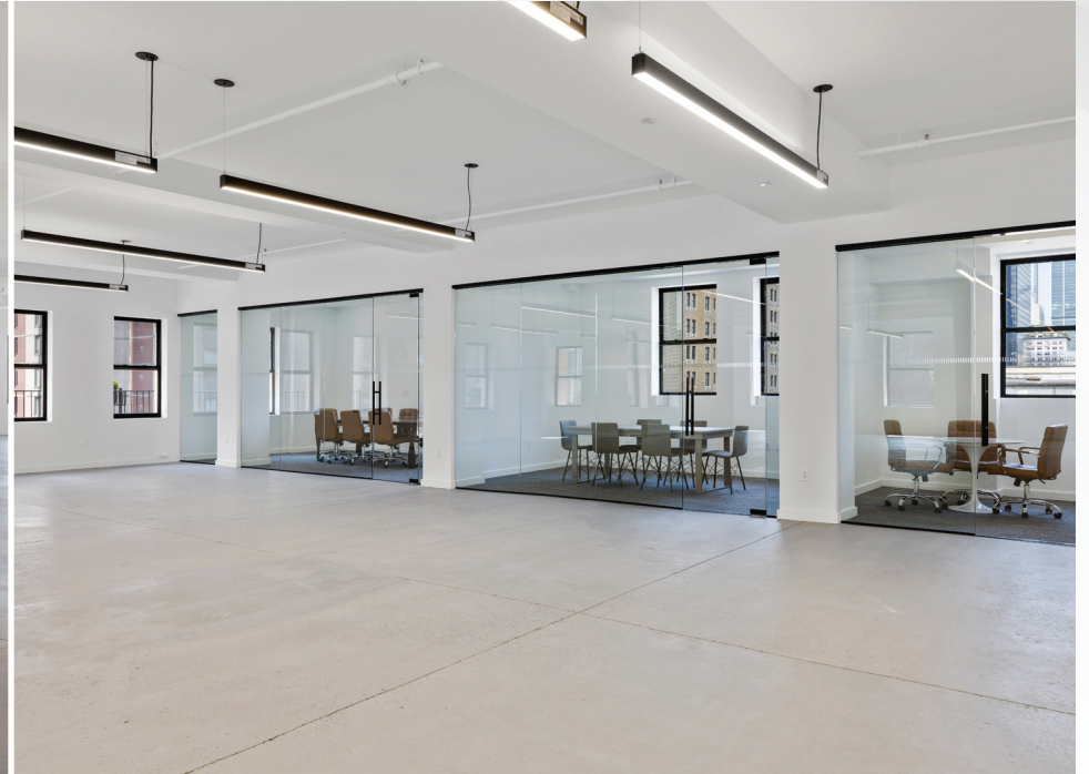
HIGH-END CREATIVE FINISHES & EXPANSIVE TERRACES