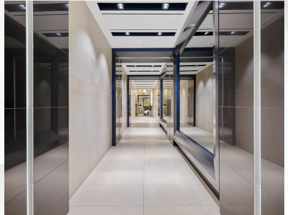
RENOVATED BUILDING LOBBY