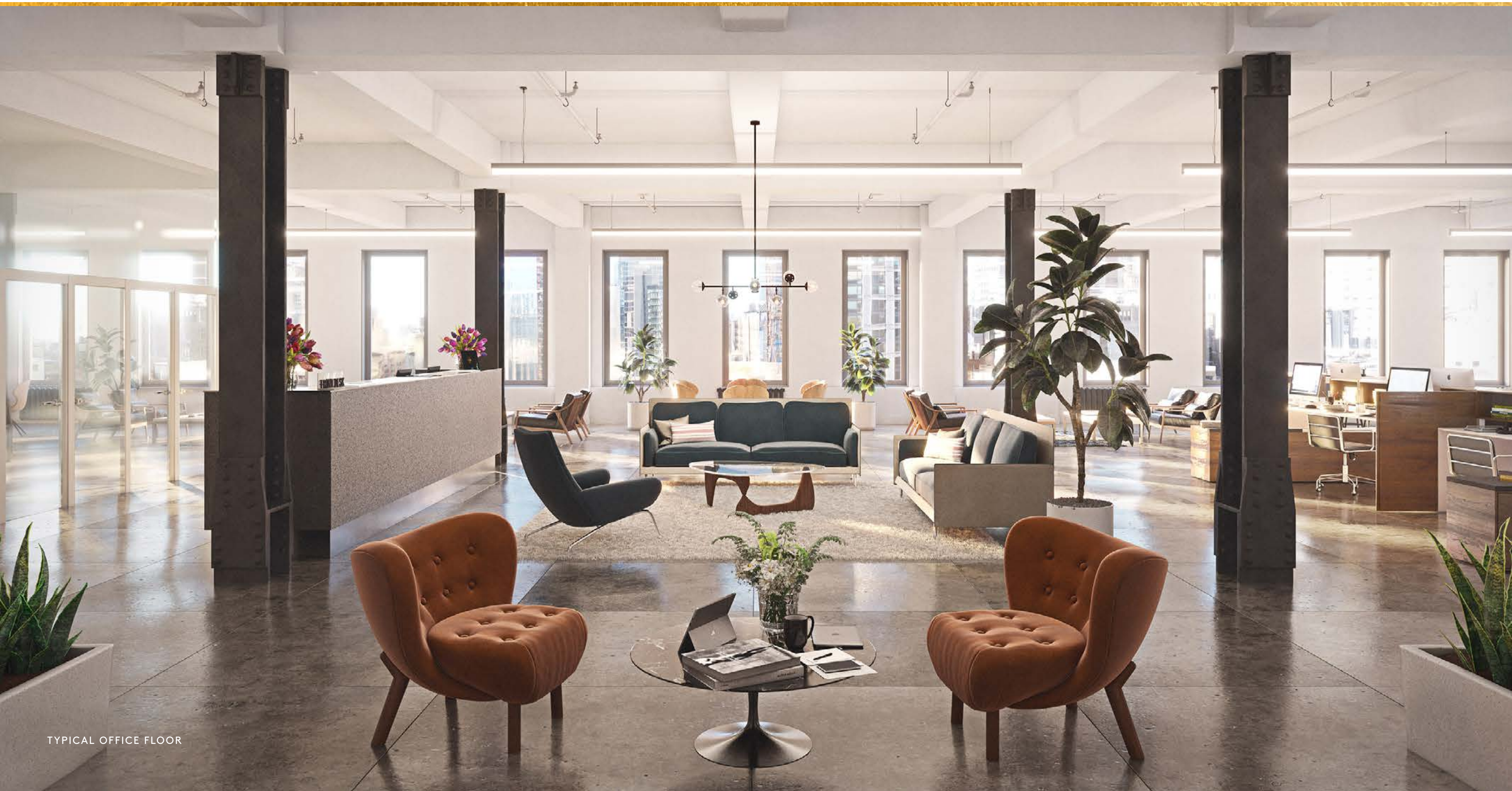
TYPICAL OFFICE FLOOR