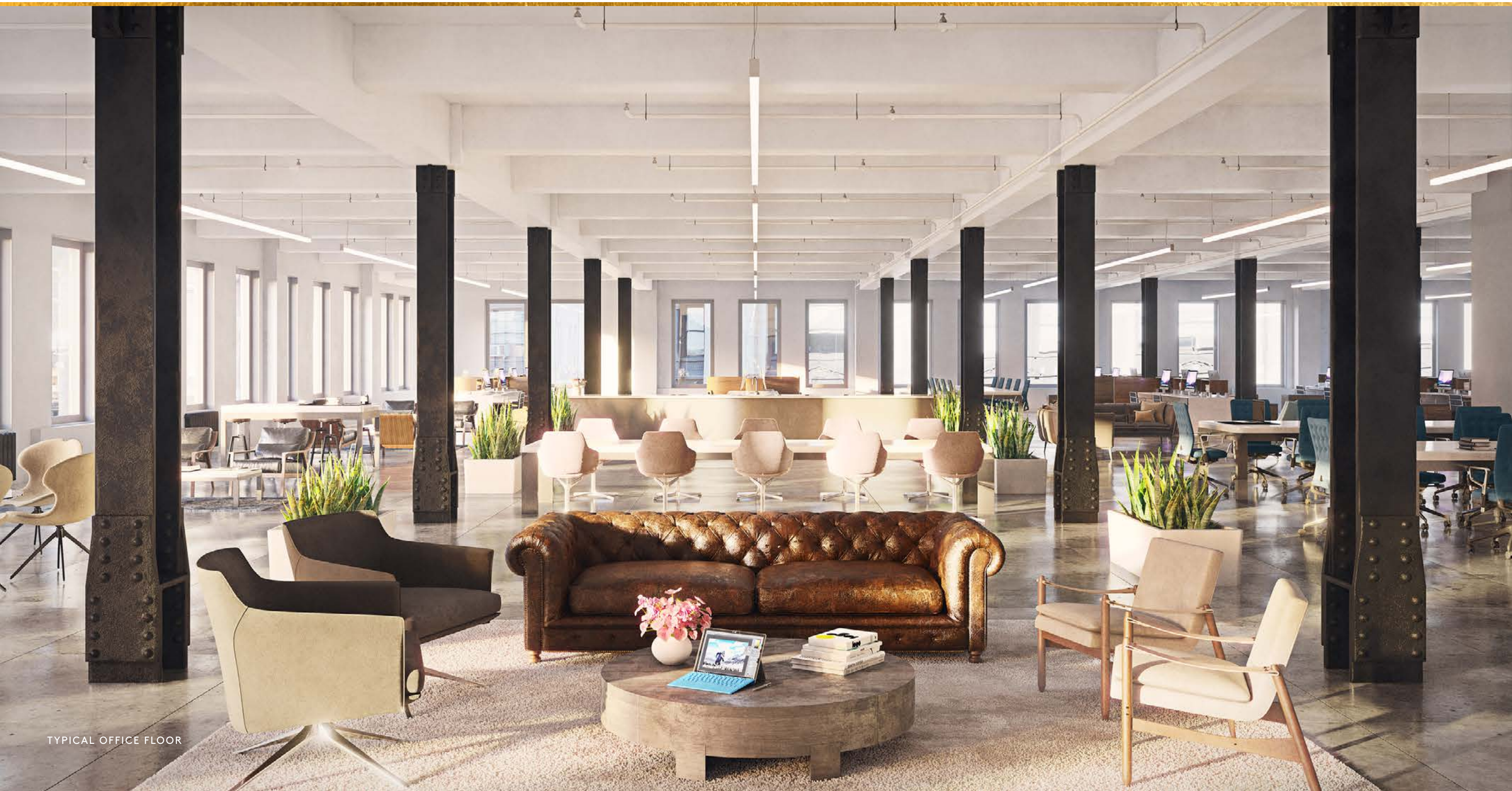
TYPICAL OFFICE FLOOR