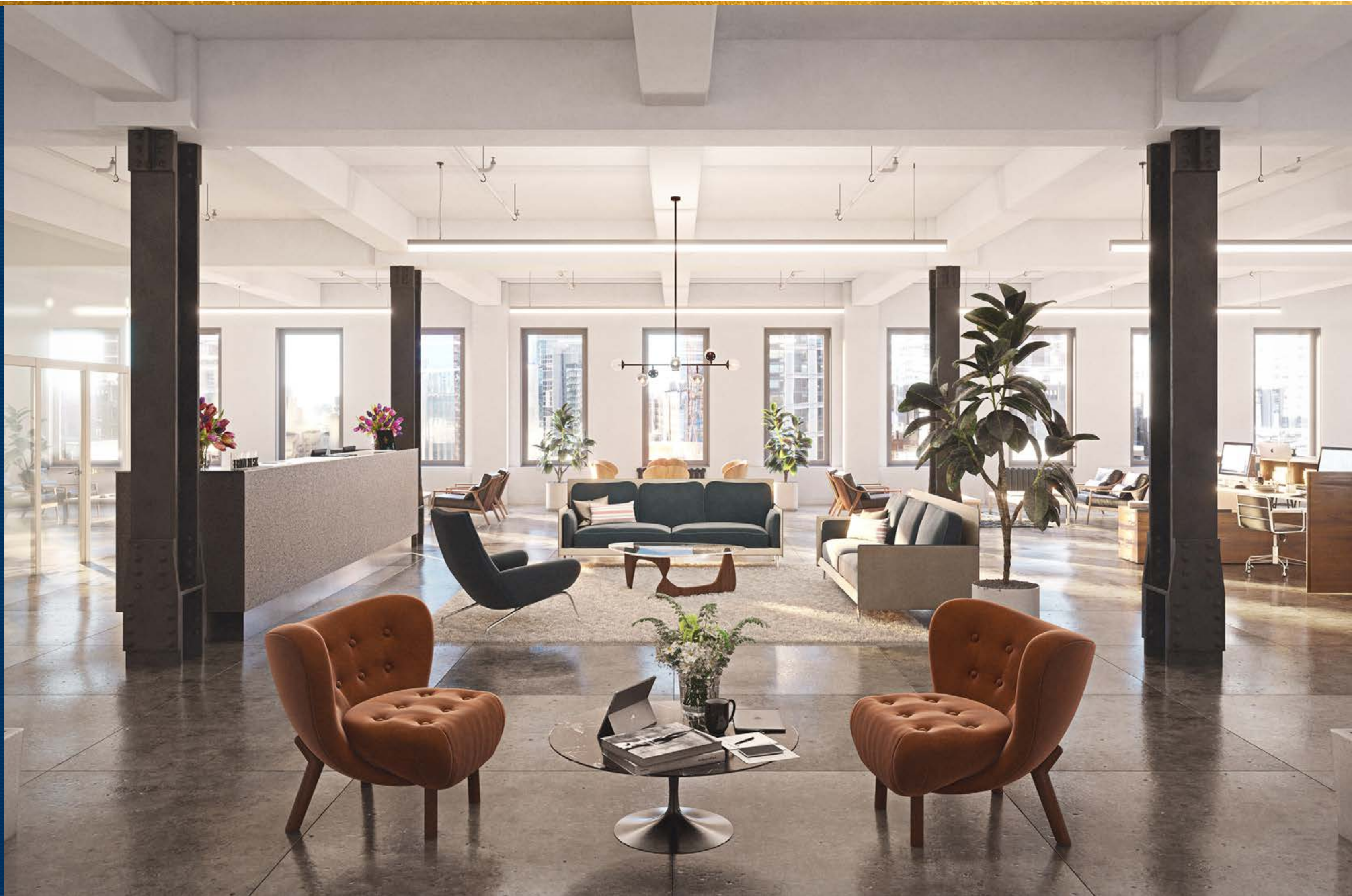
TYPICAL OFFICE FLOOR