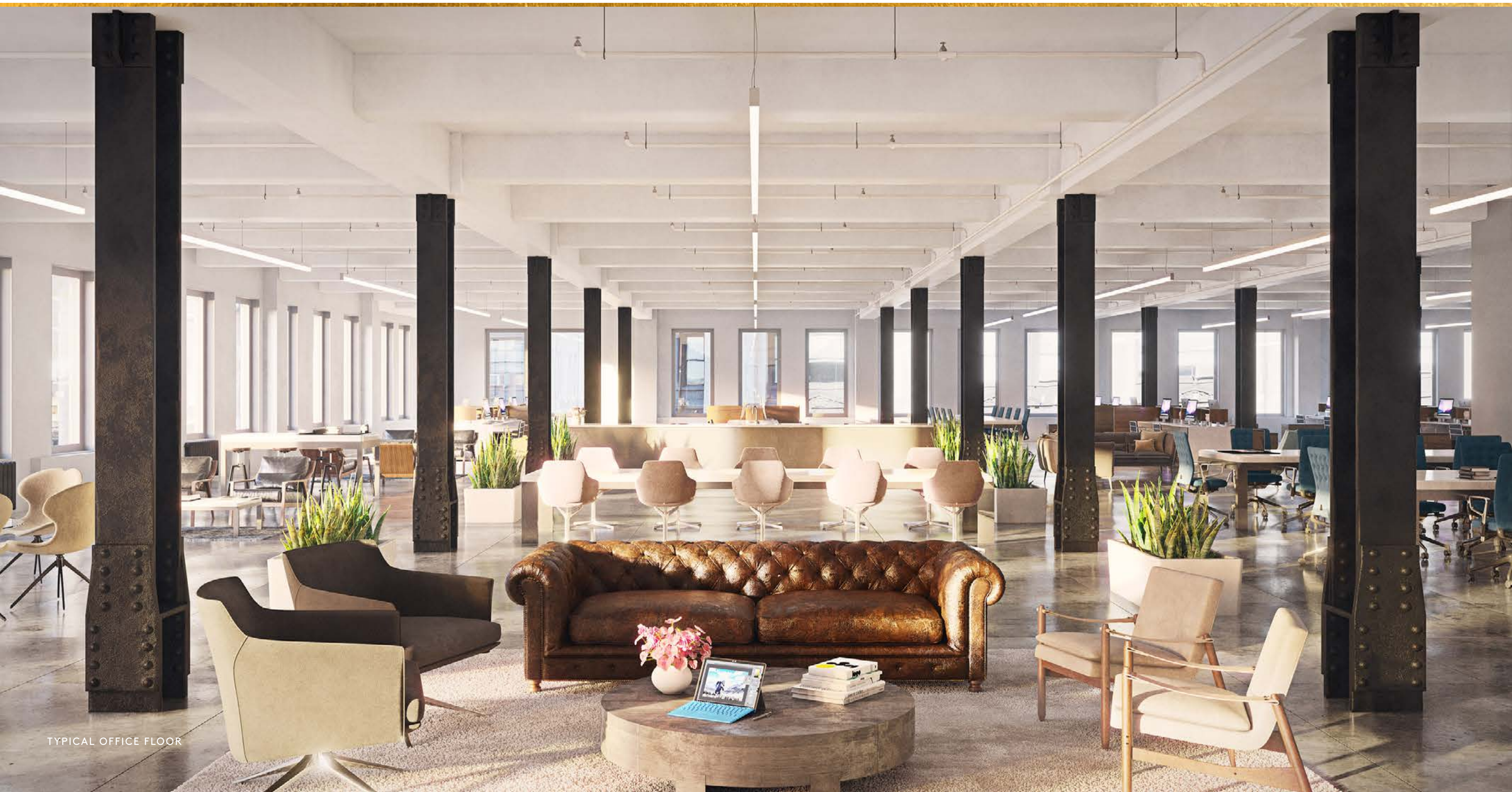
TYPICAL OFFICE FLOOR