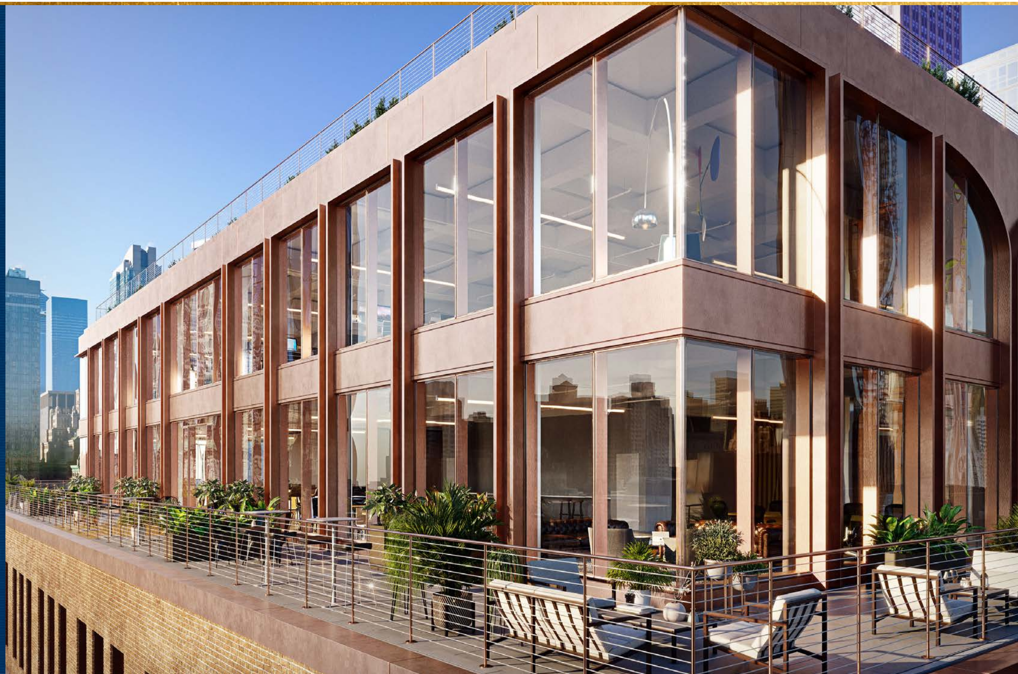
PENTHOUSE ROOF ADDITION AND TERRACE