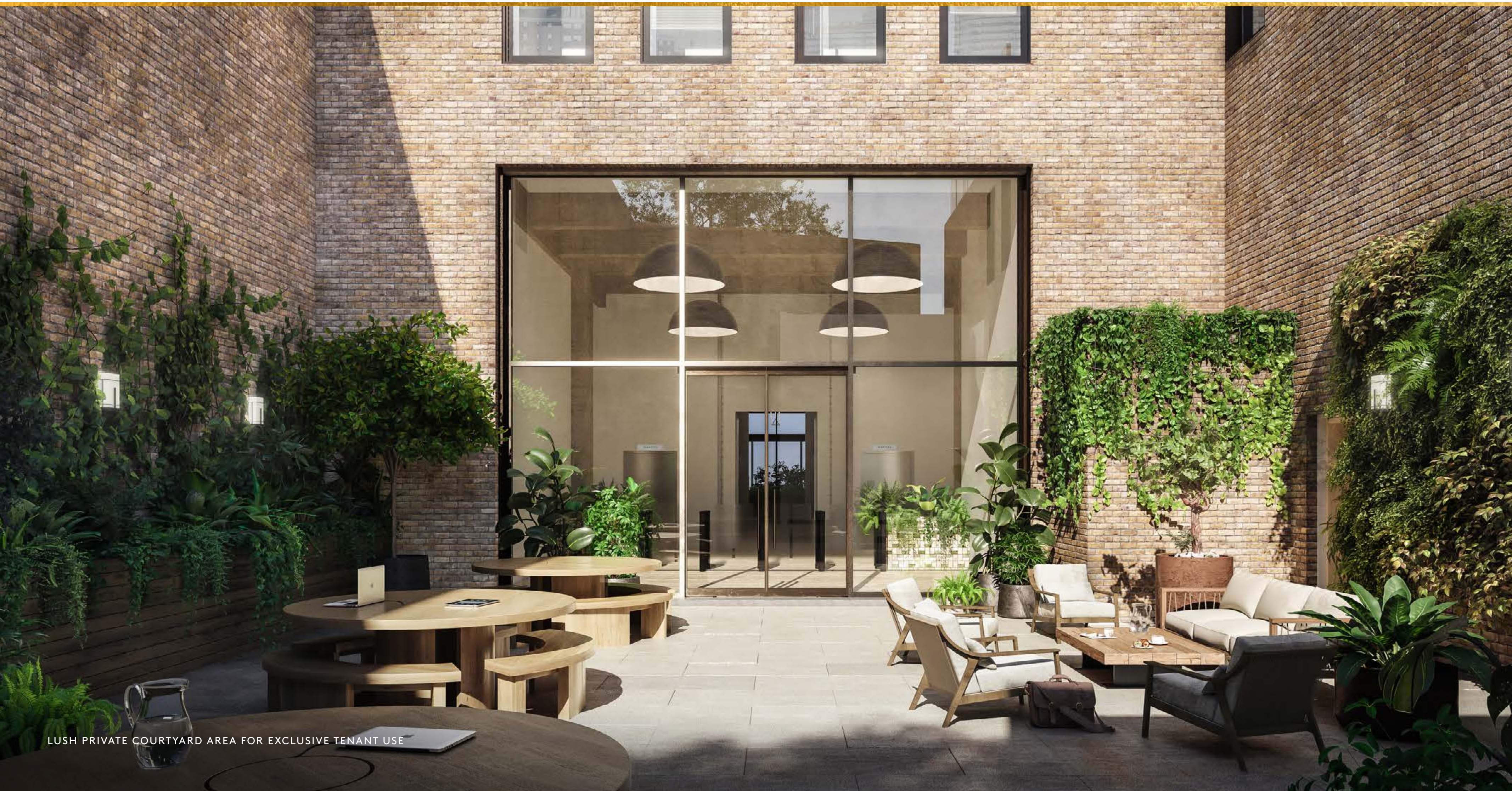
LUSH PRIVATE COURTYARD AREA FOR EXCLUSIVE TENANT USE