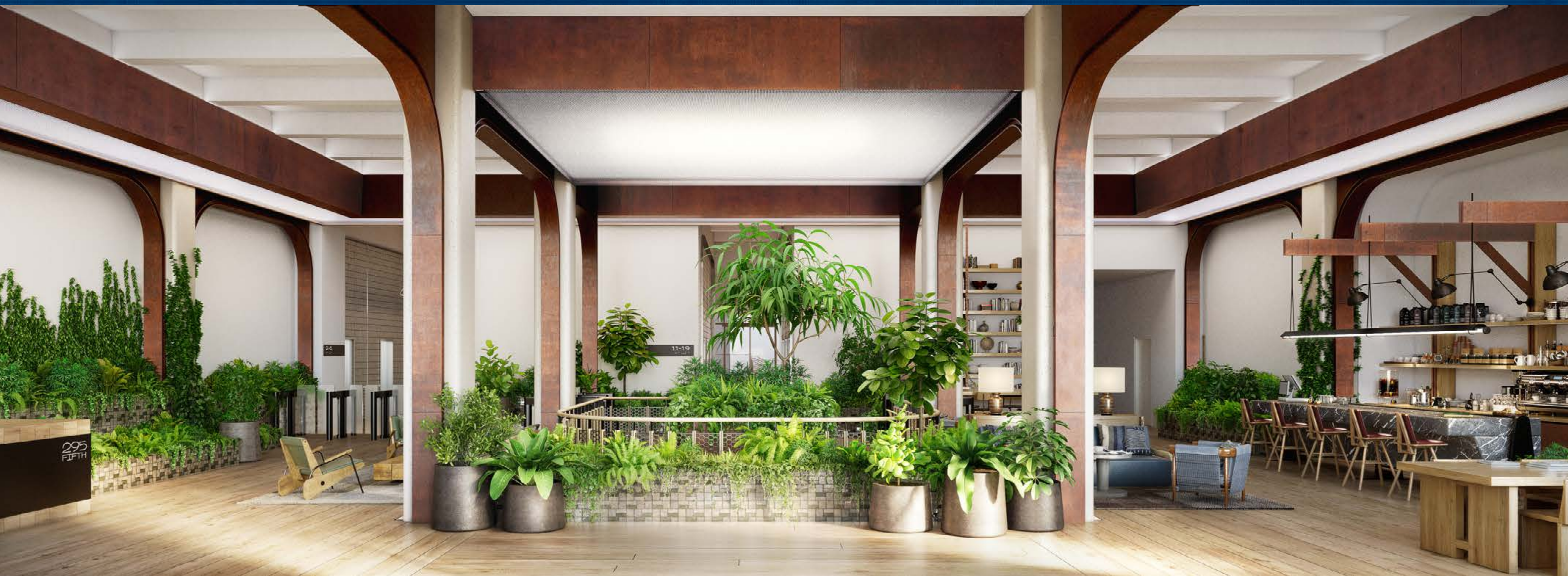
BRAND-NEW LOBBY DESIGNED BY STUDIO MAI