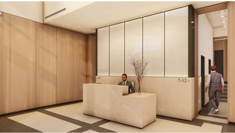
Renderings for upcoming lobby renovation