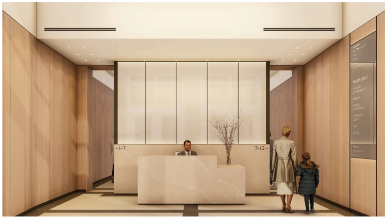
Renderings for upcoming lobby renovation