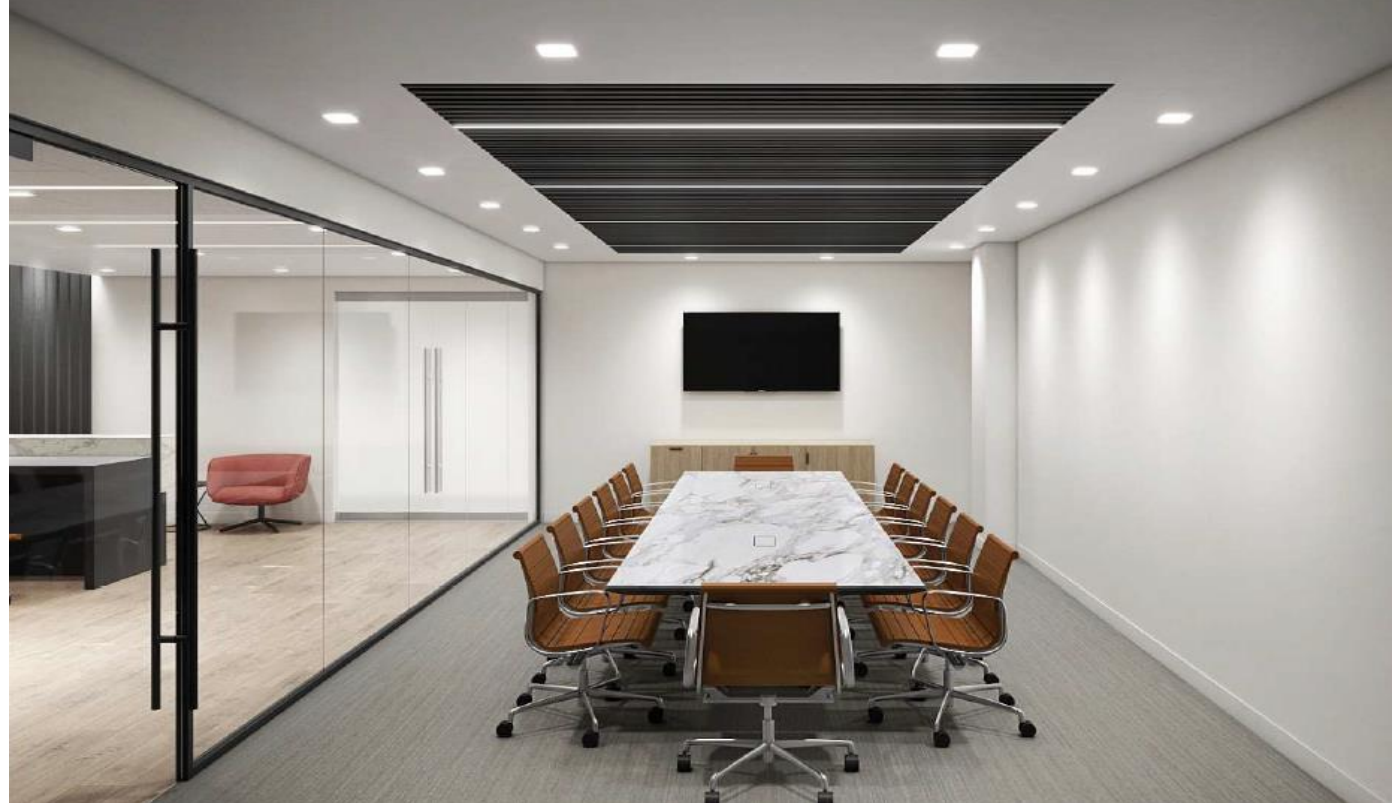
Conference Room Rendering