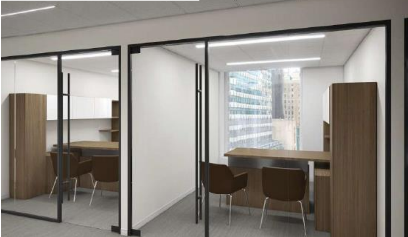
Standard Office Rendering