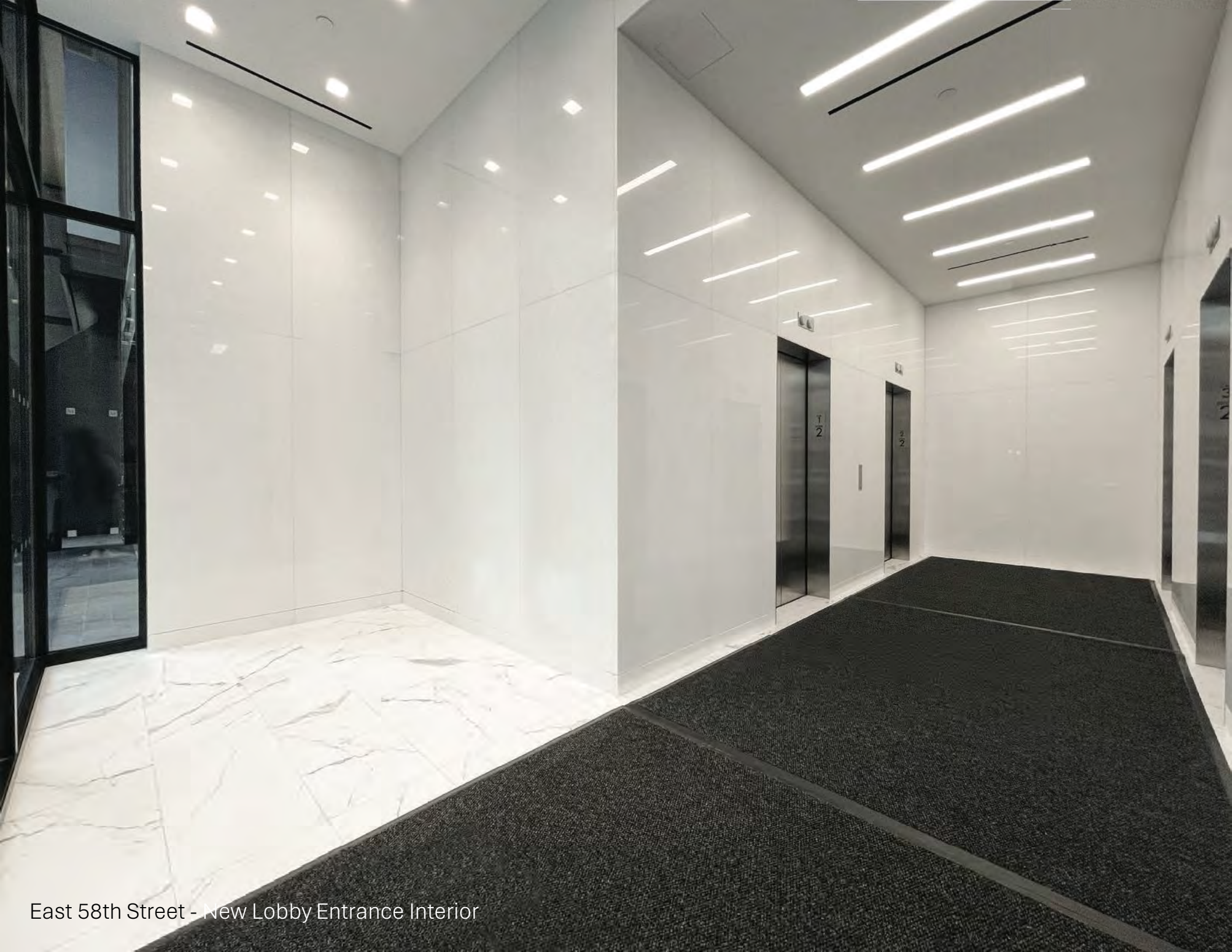
East 58th Street - New Lobby Entrance Interior