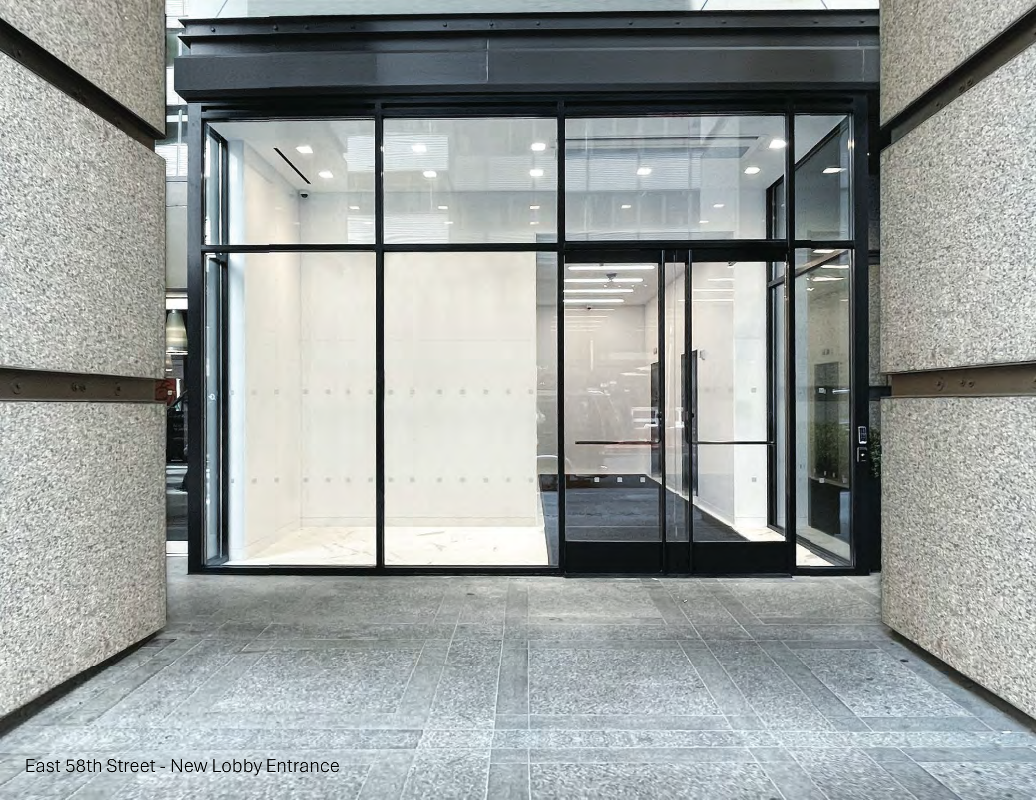
East 58th Street - New Lobby Entrance