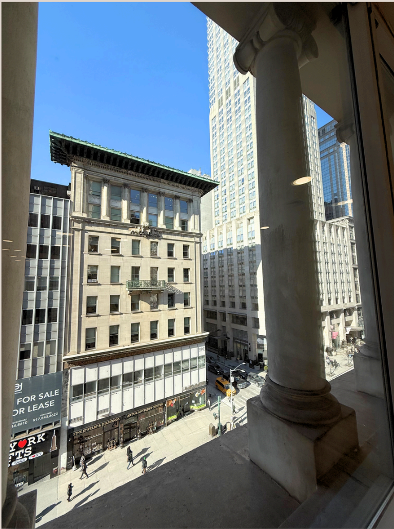
View From 6th Floor