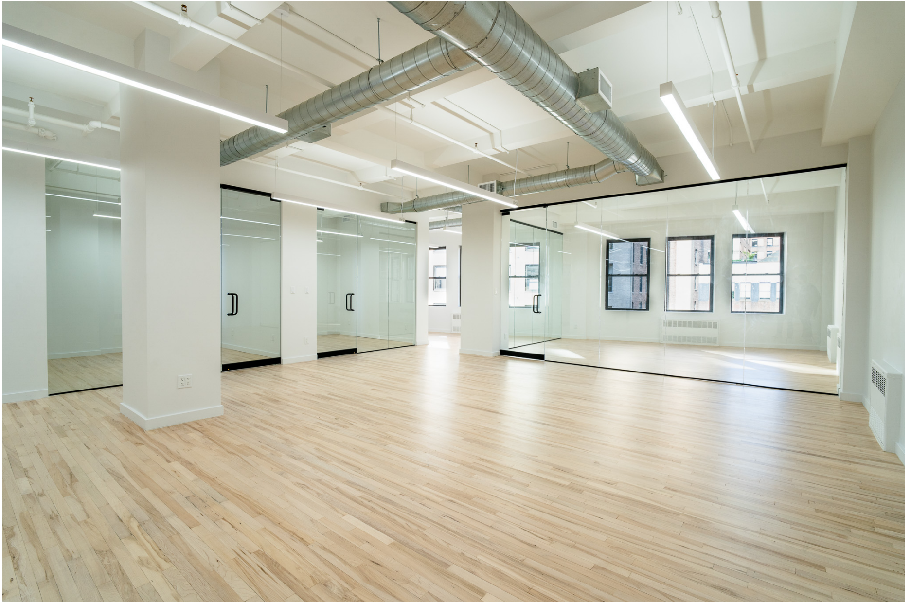
928 Broadway-Flatiron District New Pre Build-2950 SF