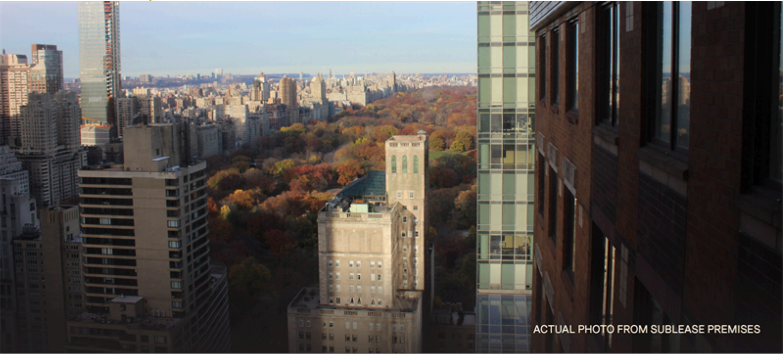
ACTUAL PHOTO FROM SUBLEASE PREMISES