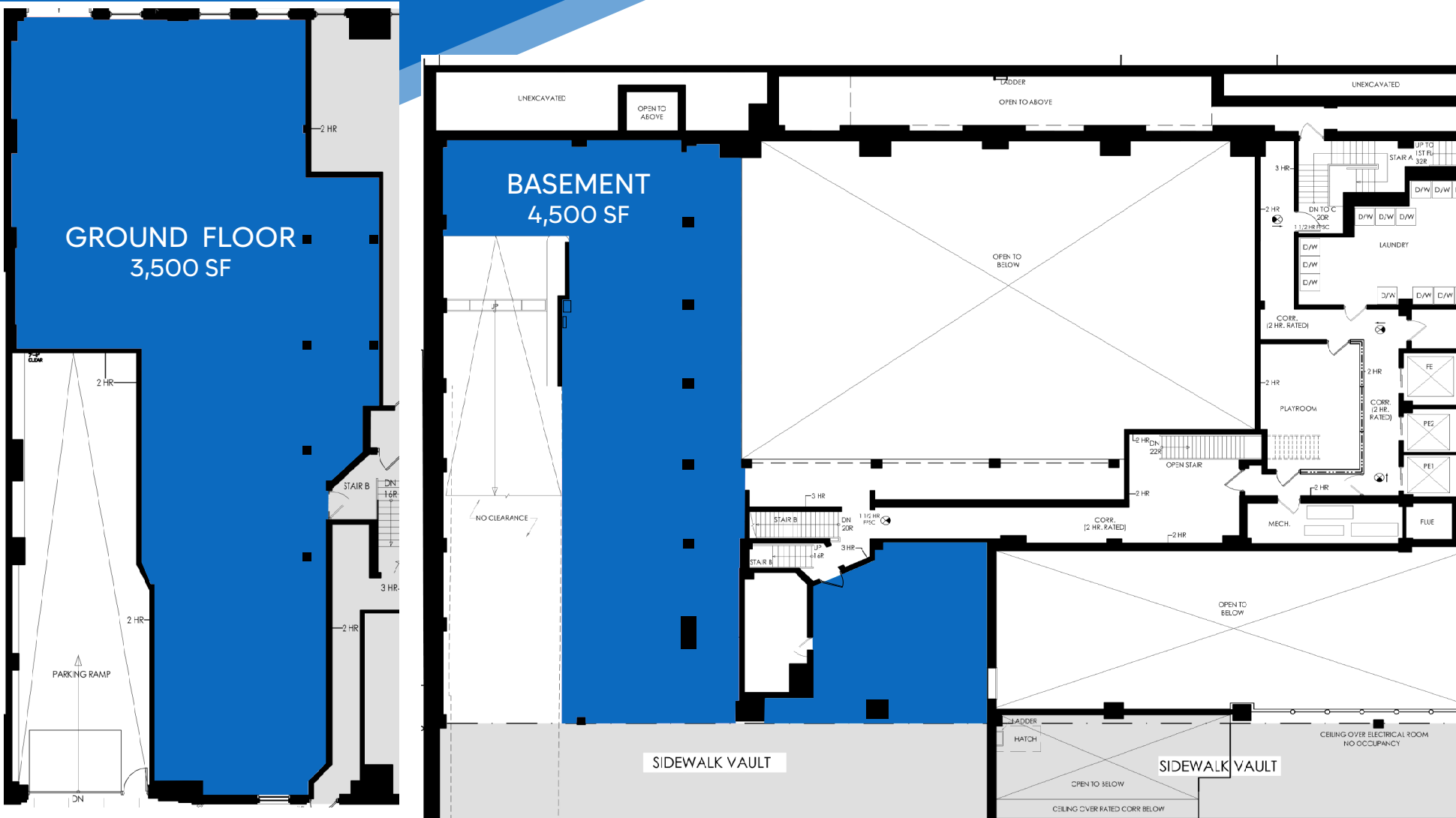
ENTRANCE ON 73 RD STREET