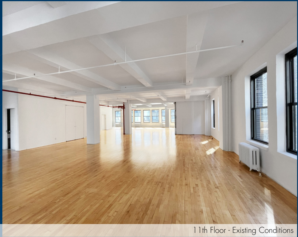
11th Floor - Existing Conditions