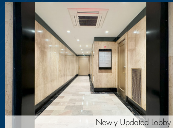
Newly Updated Lobby