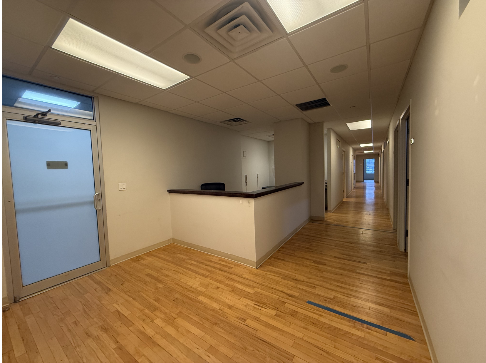
928 Broadway 4100sf Suite Available