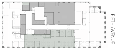
WEST 48 TH STREET

New York City 10th Floor Suite 1020 | 4,337 RSF Available Q4 2025