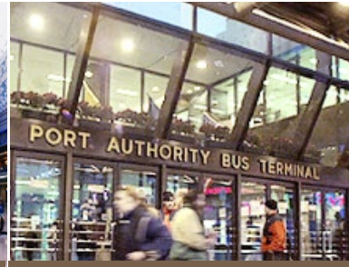
Port Authority Bus Terminal