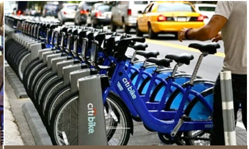
CitiBike Stations Nearby