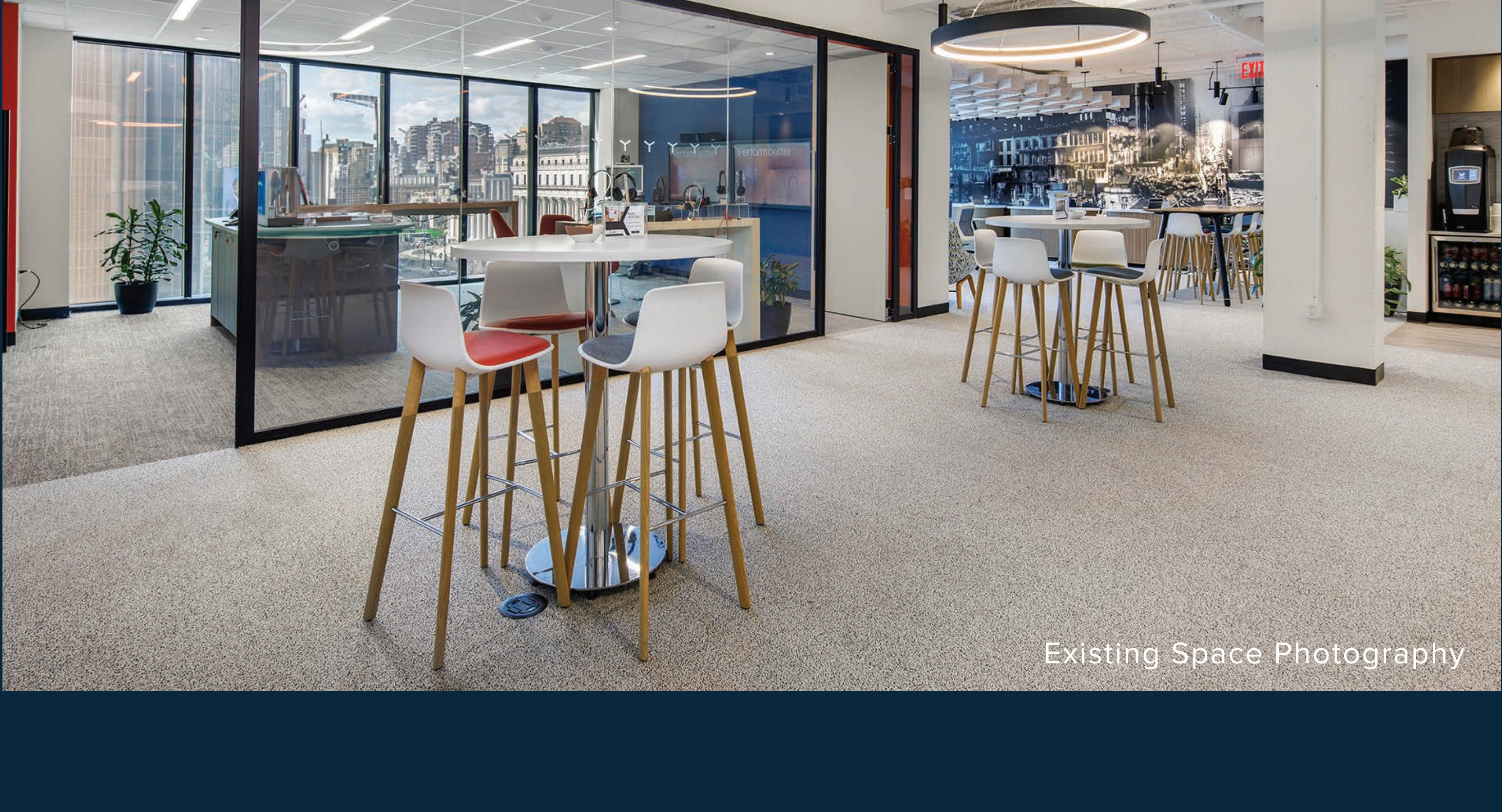
Existing Space Photography