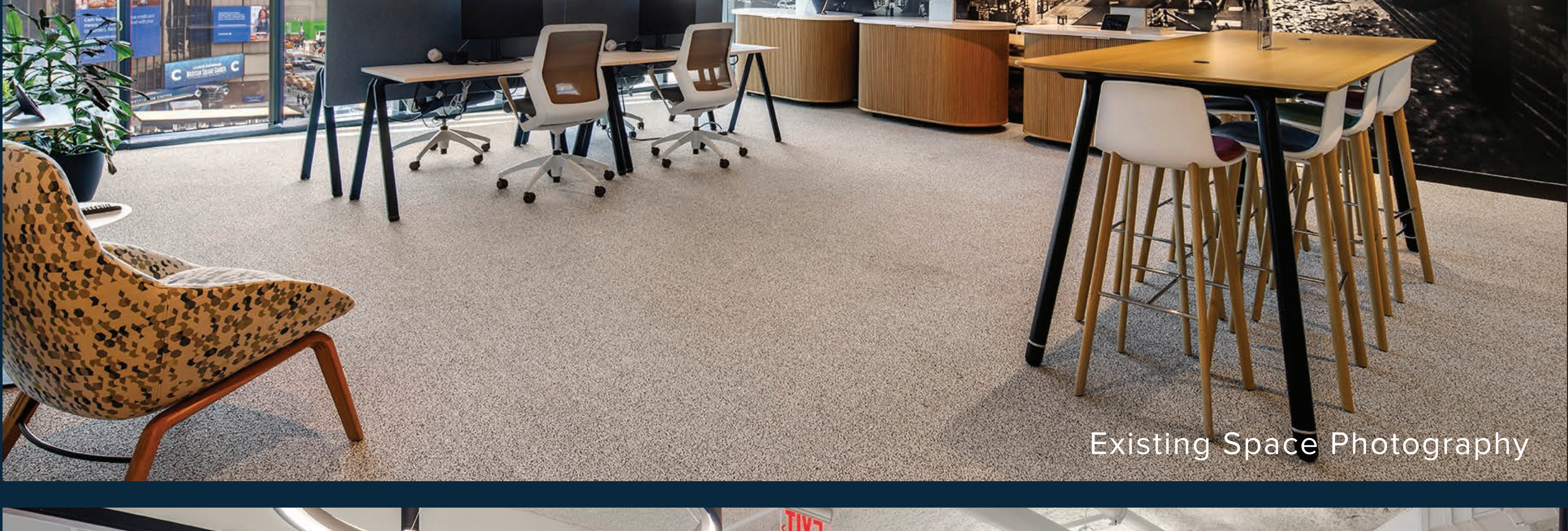
Existing Space Photography