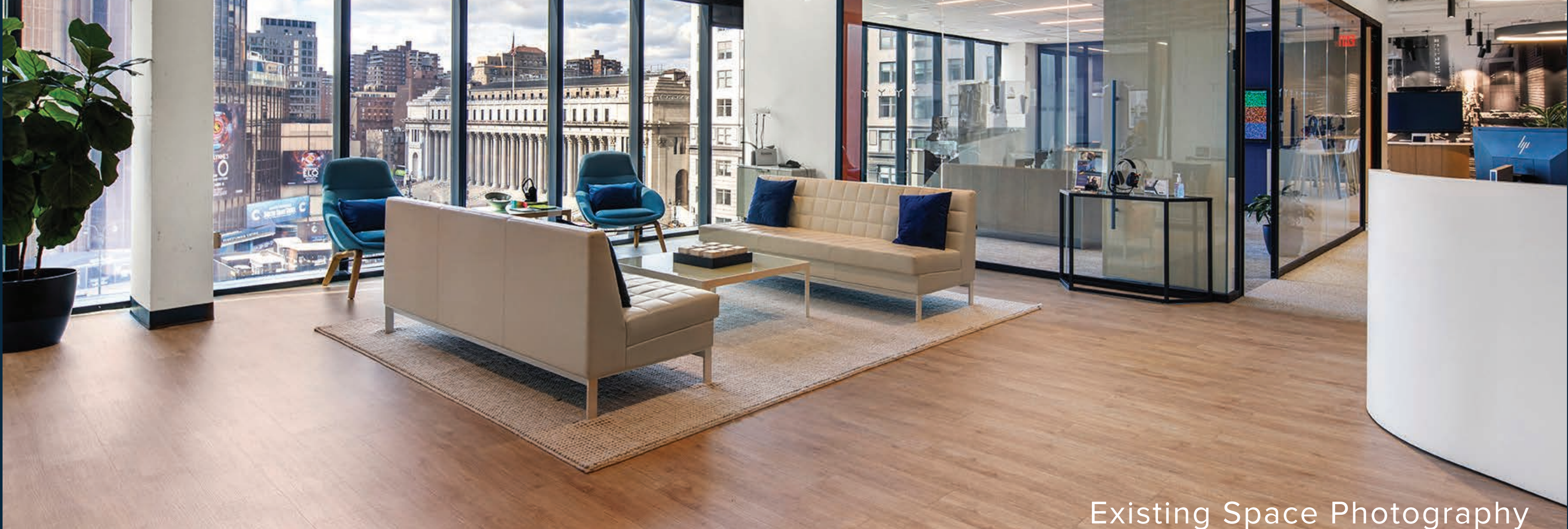
Existing Space Photography

Boutique Penn District Opportunity 13,959 SF AVAILABLE Three Full Floors of 4,653 SF