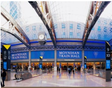
Moynihan Train Hall