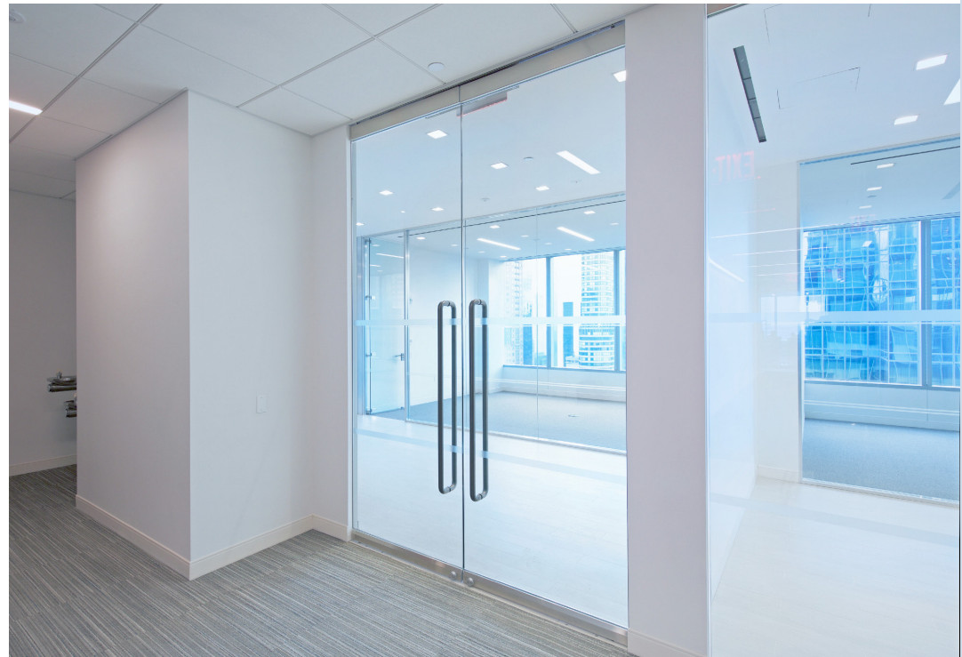
Images are representative of the finishes used in the available space.