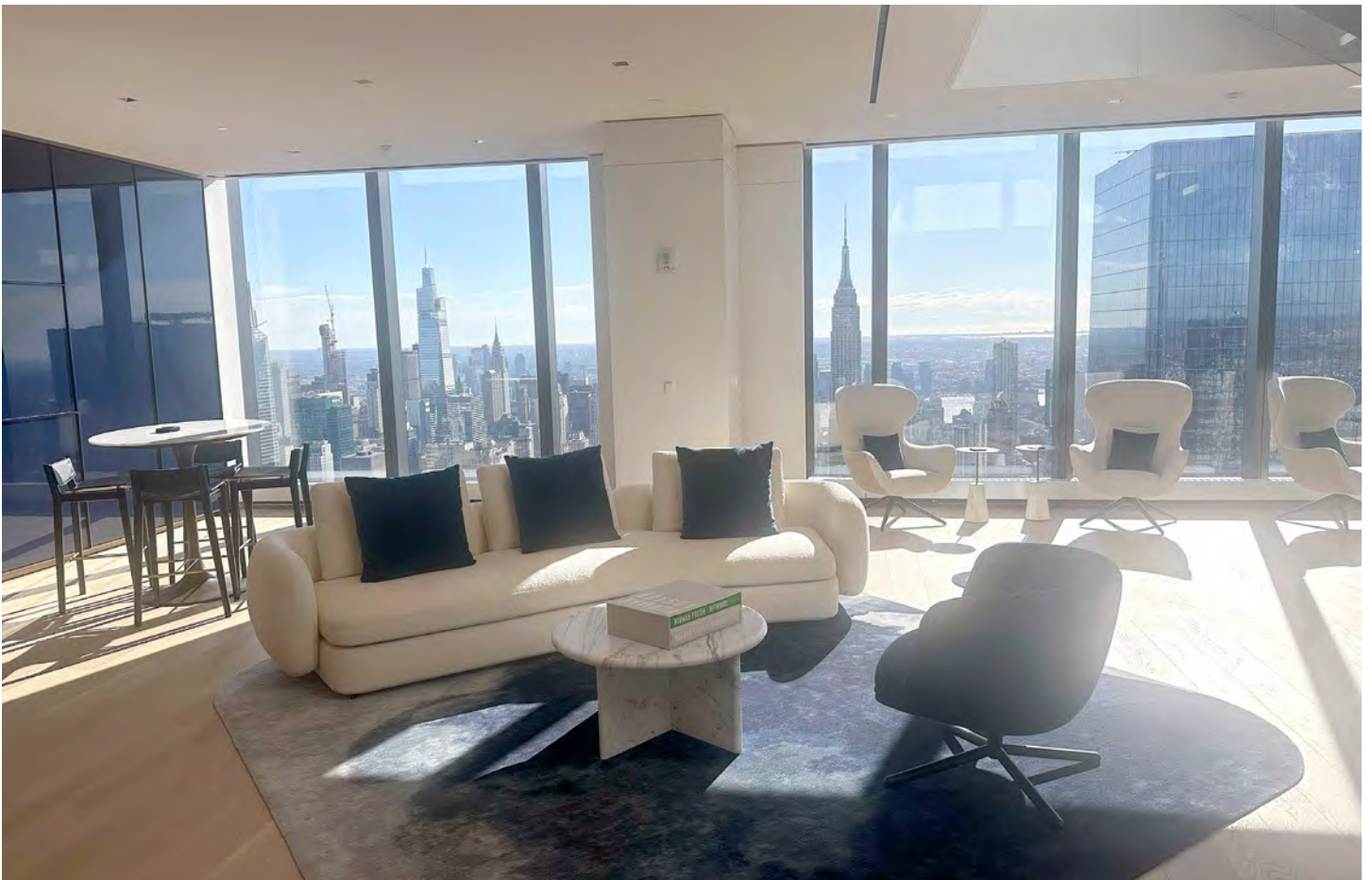
50 Hudson Yards, New York, NY 10001