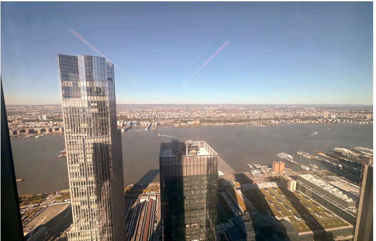
50 Hudson Yards, New York, NY 10001