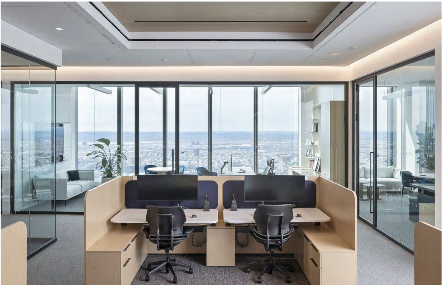
50 Hudson Yards, New York, NY 10001