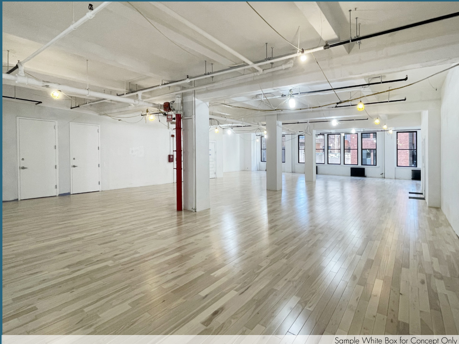
Sample White Box for Concept Only