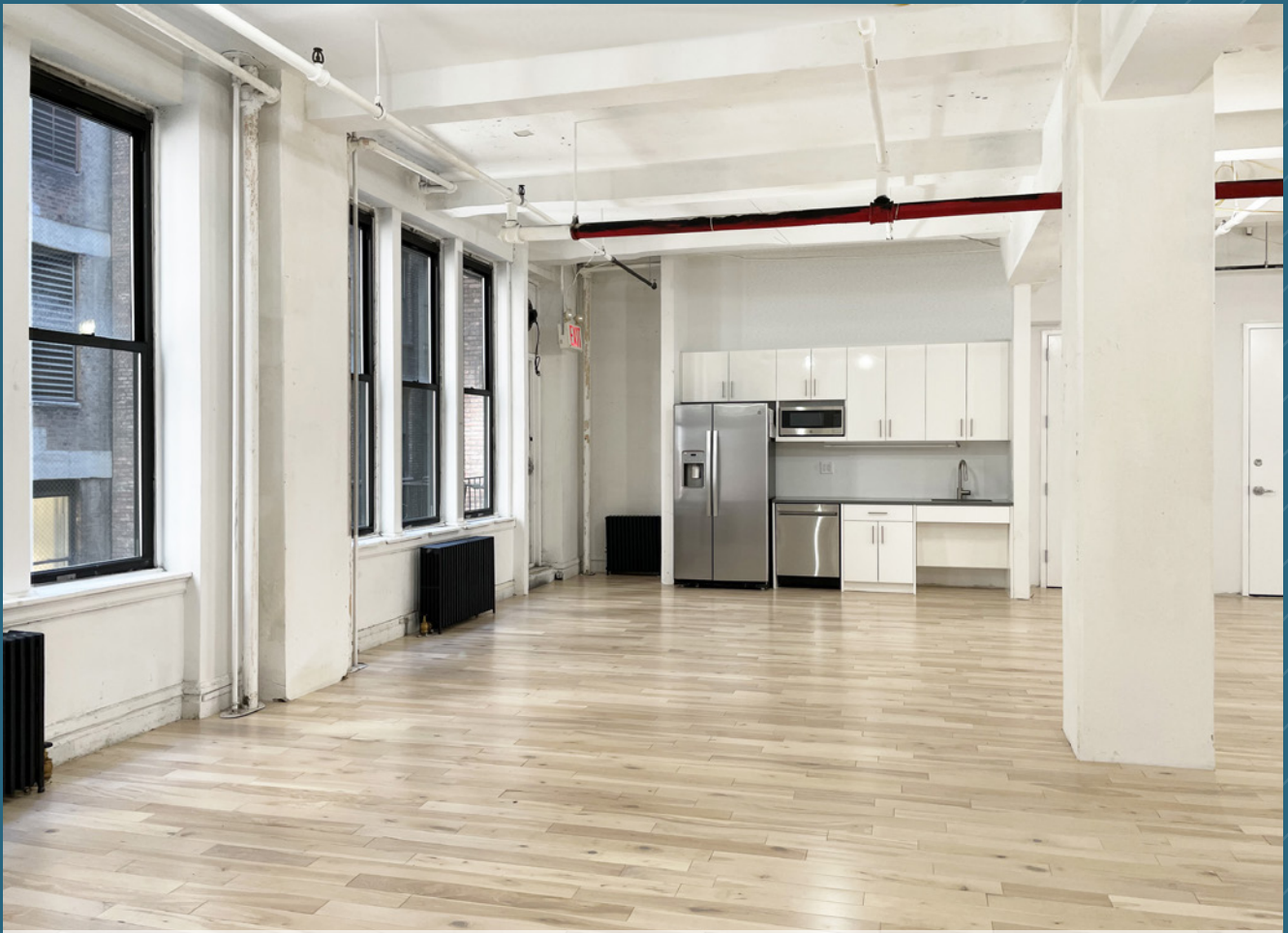
Sample Building Standard Finishes