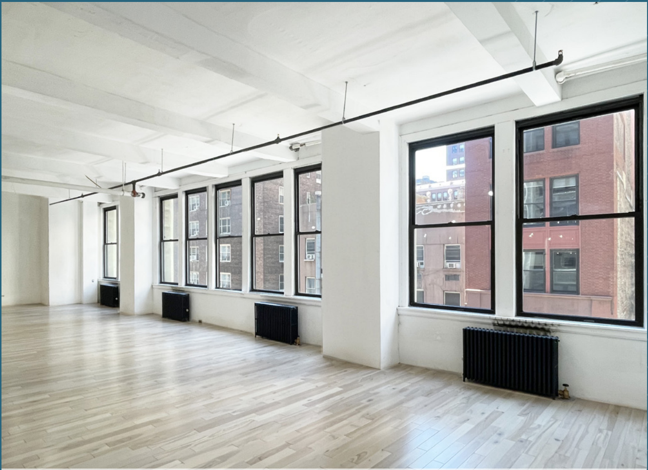
Sample White Box for Concept Only