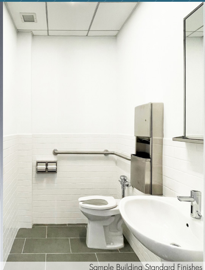
Sample Building Standard Finishes