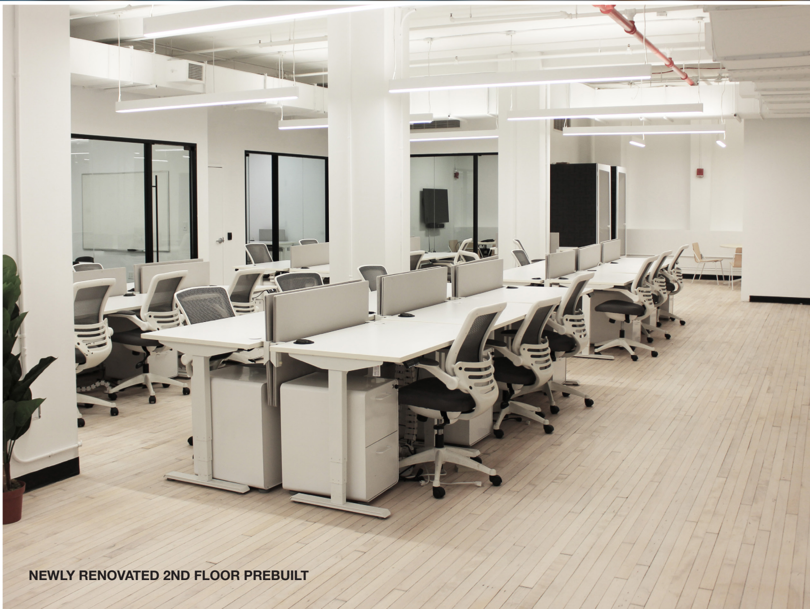
NEWLY RENOVATED 2ND FLOOR PREBUILT