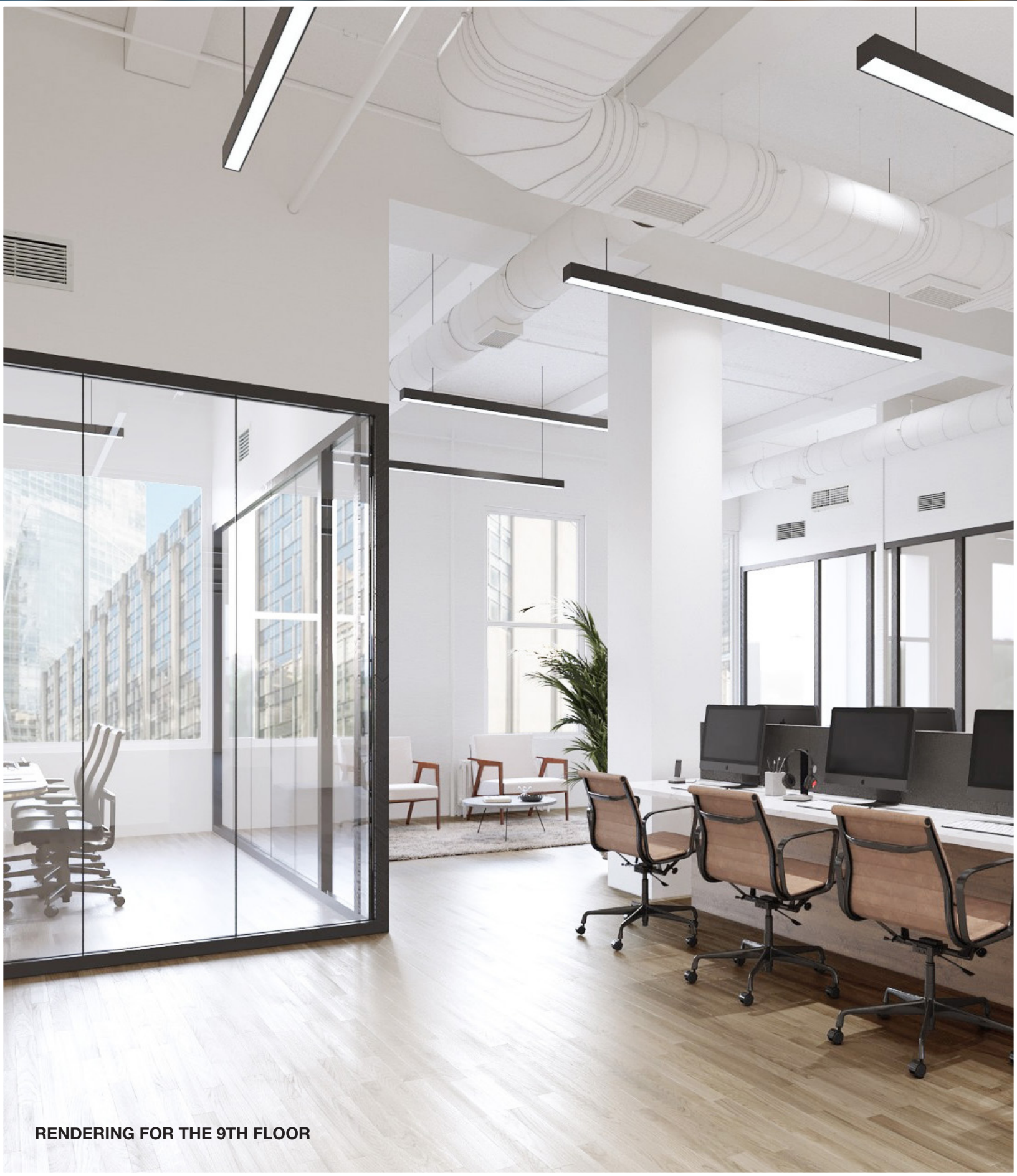
RENDERING FOR THE 9TH FLOOR