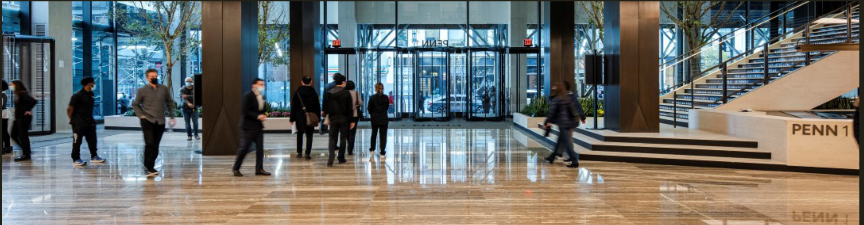
34TH STREET LOBBY LOOKING NORTH