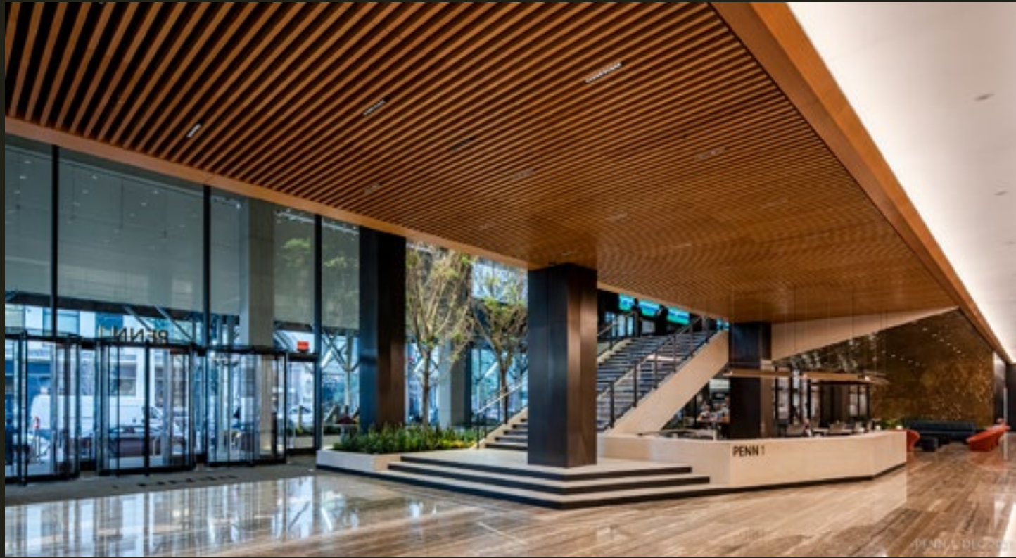
34TH STREET LOBBY AND STAIR LEADING UP TO THE NEW SOCIAL STAIR