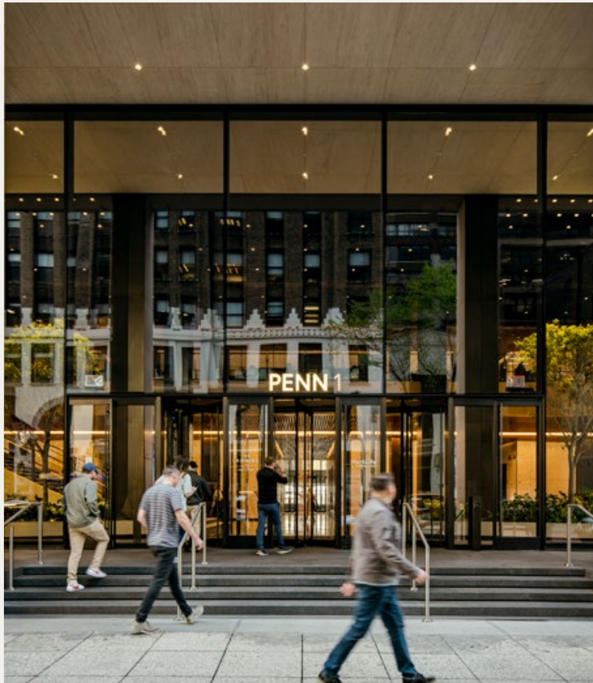
PENN 1 34 TH STREET PLAZA AND ENTRANCE