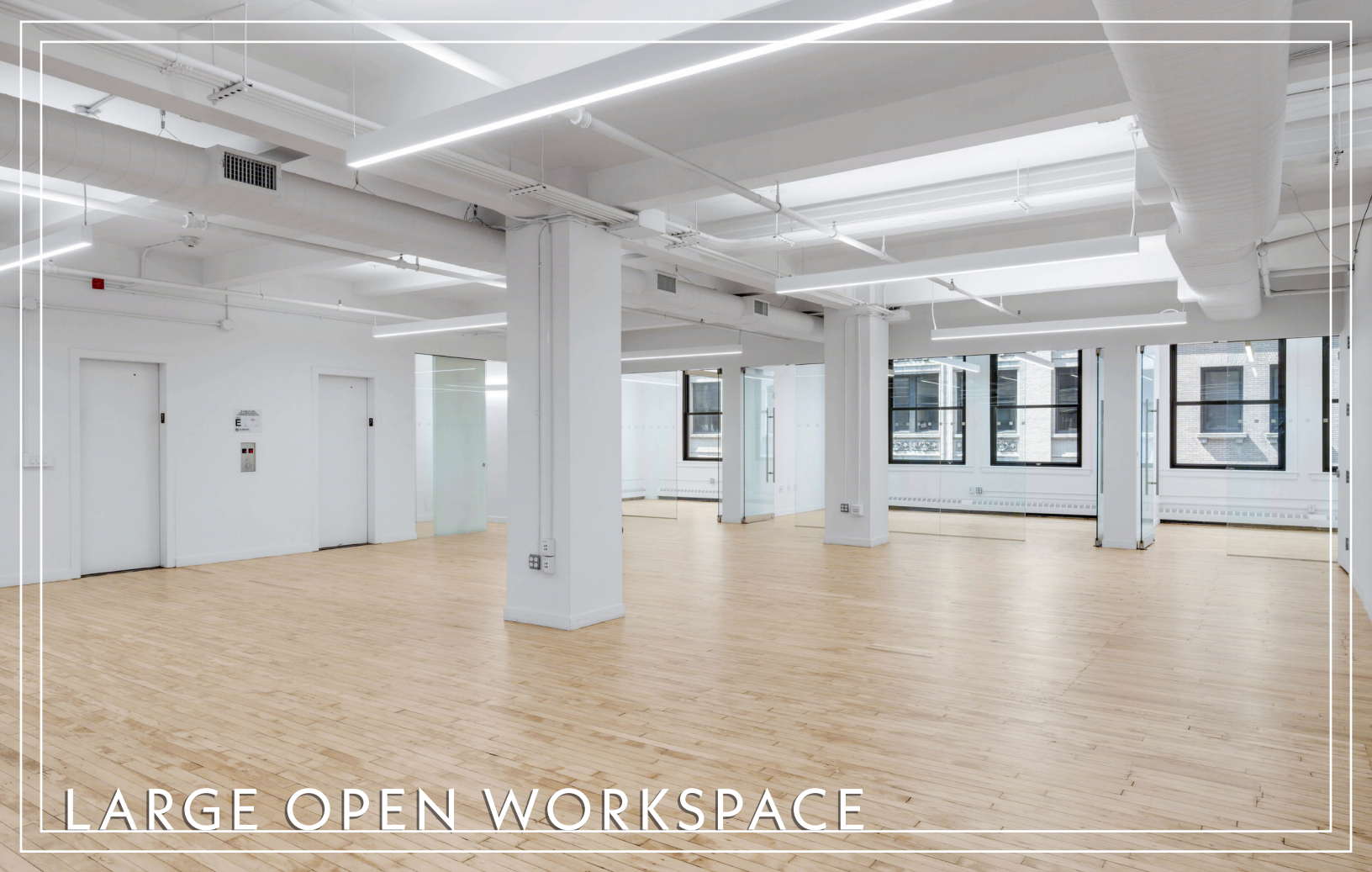
LARGE OPEN WORKSPACE