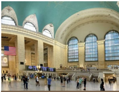
Walk to Grand Central Terminal