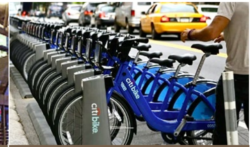
CitiBike Stations Nearby