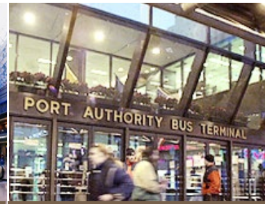
Port Authority Bus Terminal