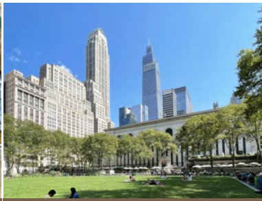
Blocks from Bryant Park