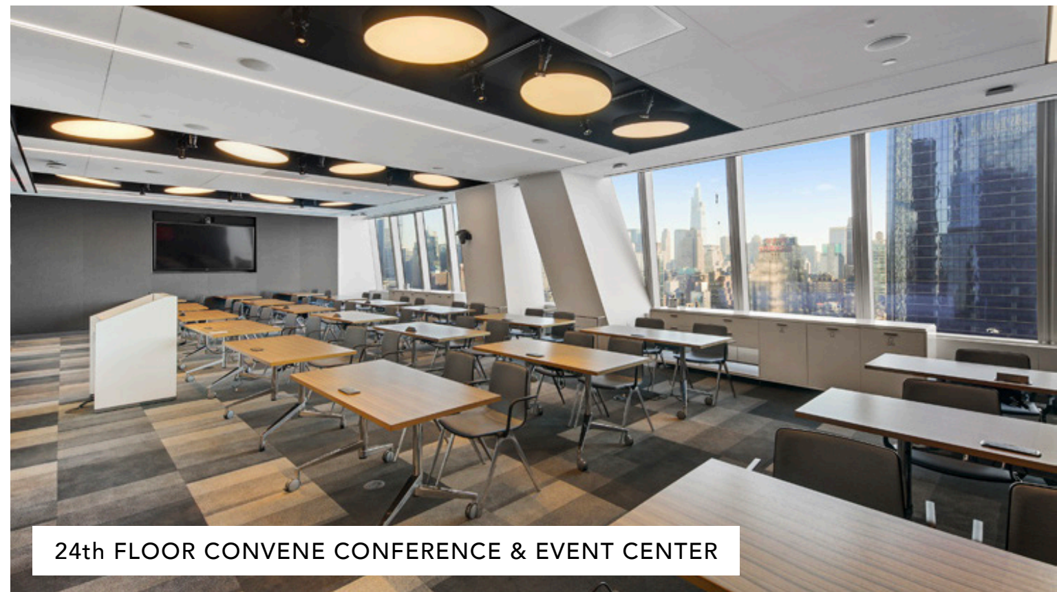
24th FLOOR CONVENE CONFERENCE & EVENT CENTER