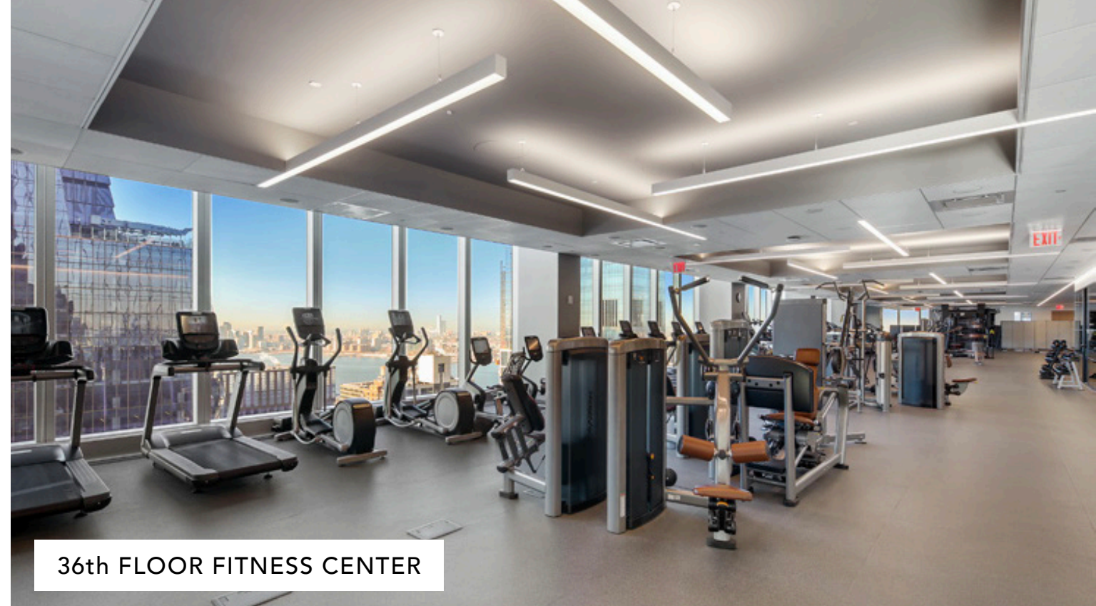
36th FLOOR FITNESS CENTER