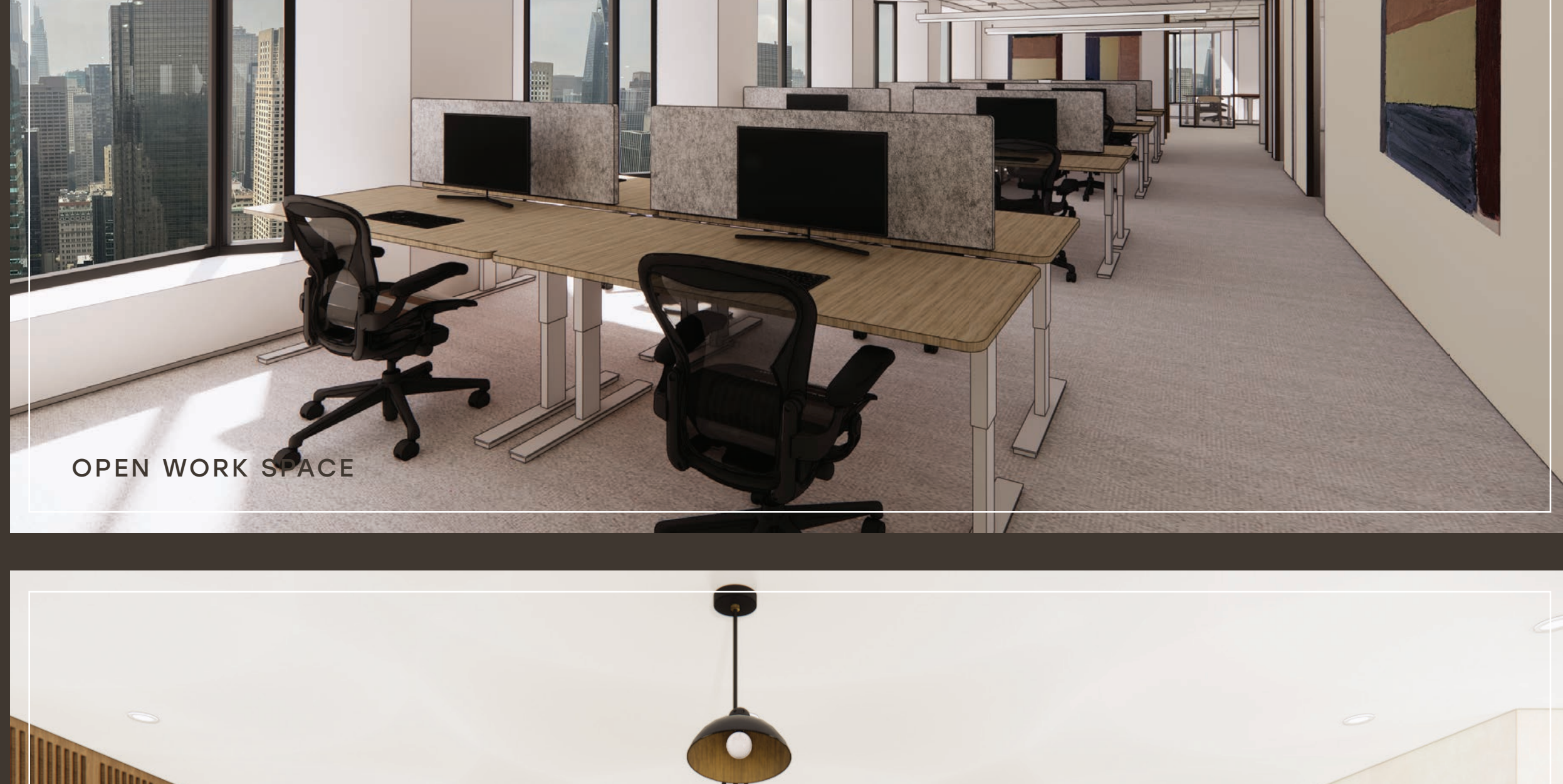
OPEN WORK SPACE