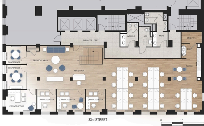
171 MADISON AVE