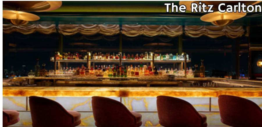
The Ritz Carlton