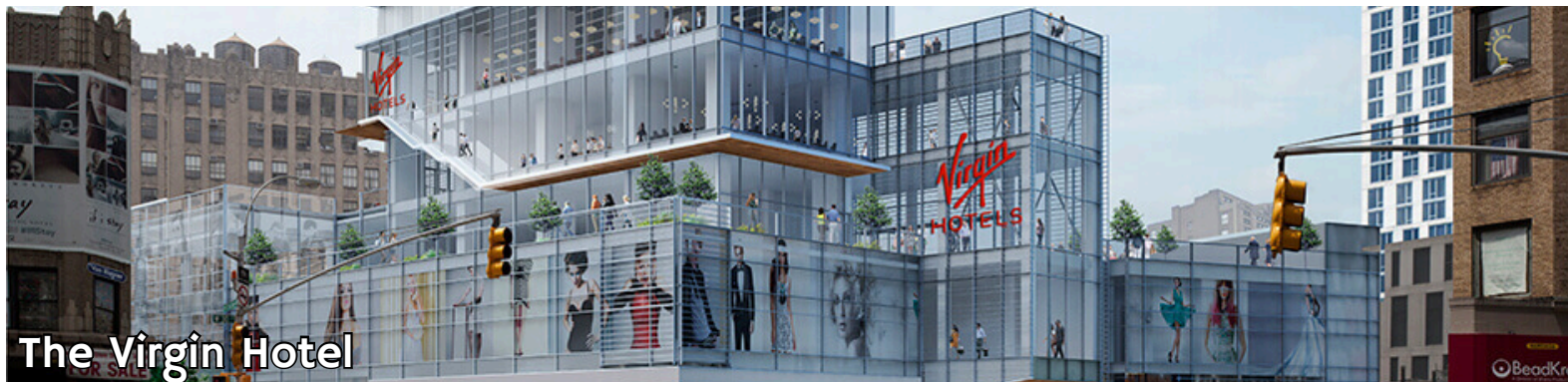
The Virgin Hotel