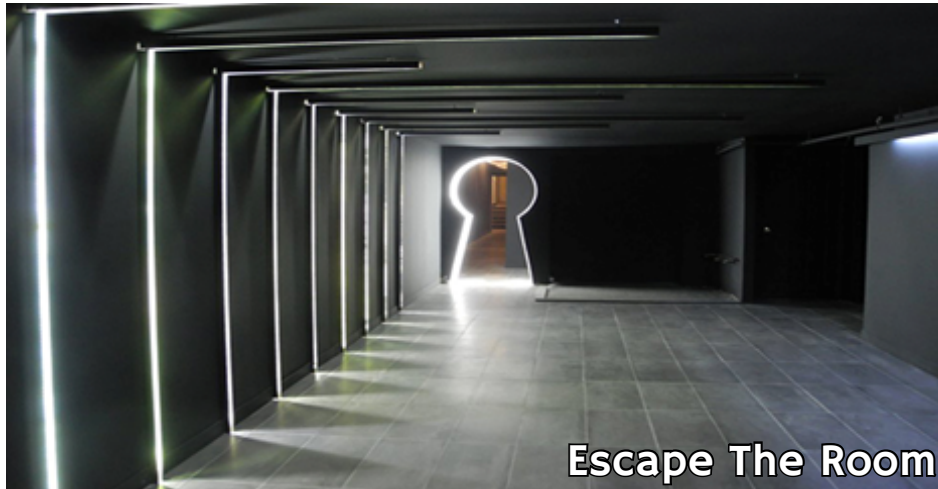
Escape The Room