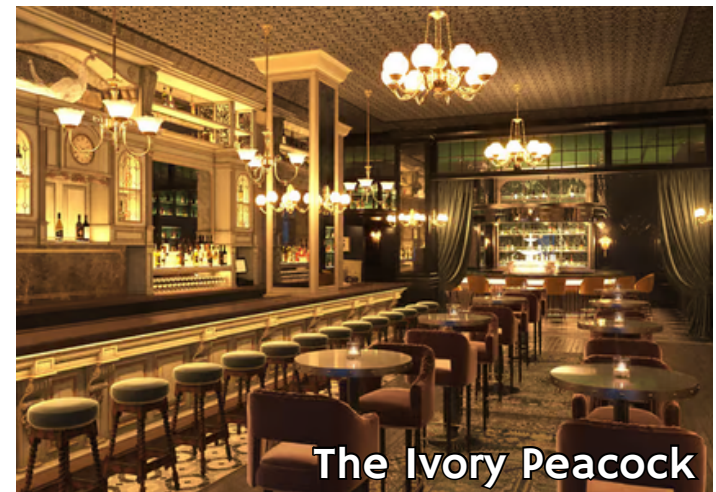
The Ivory Peacock