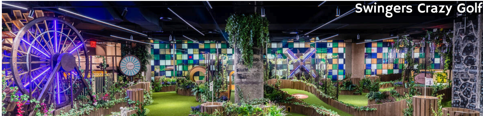
Swingers Crazy Golf