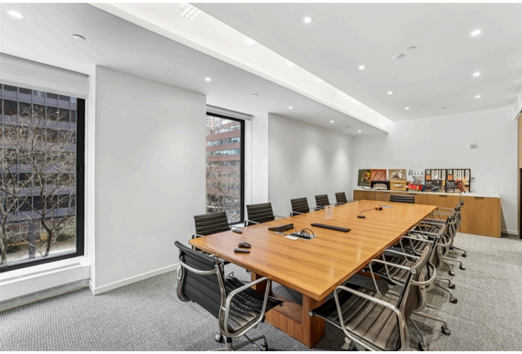
Large Conference Room