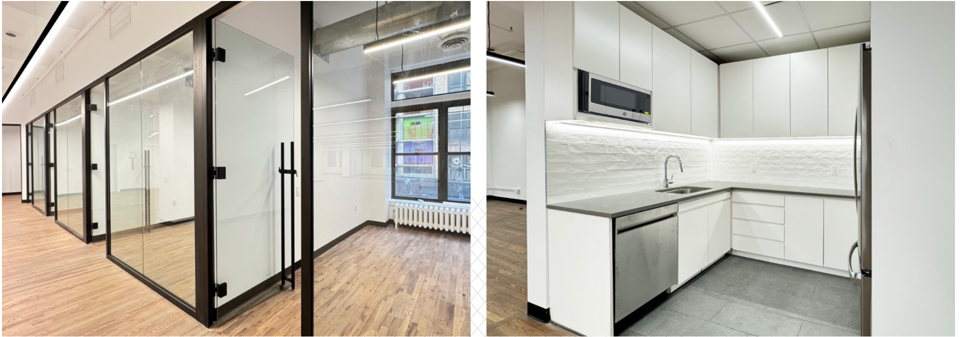
SAMPLE BUILDING STANDARD FINISHES