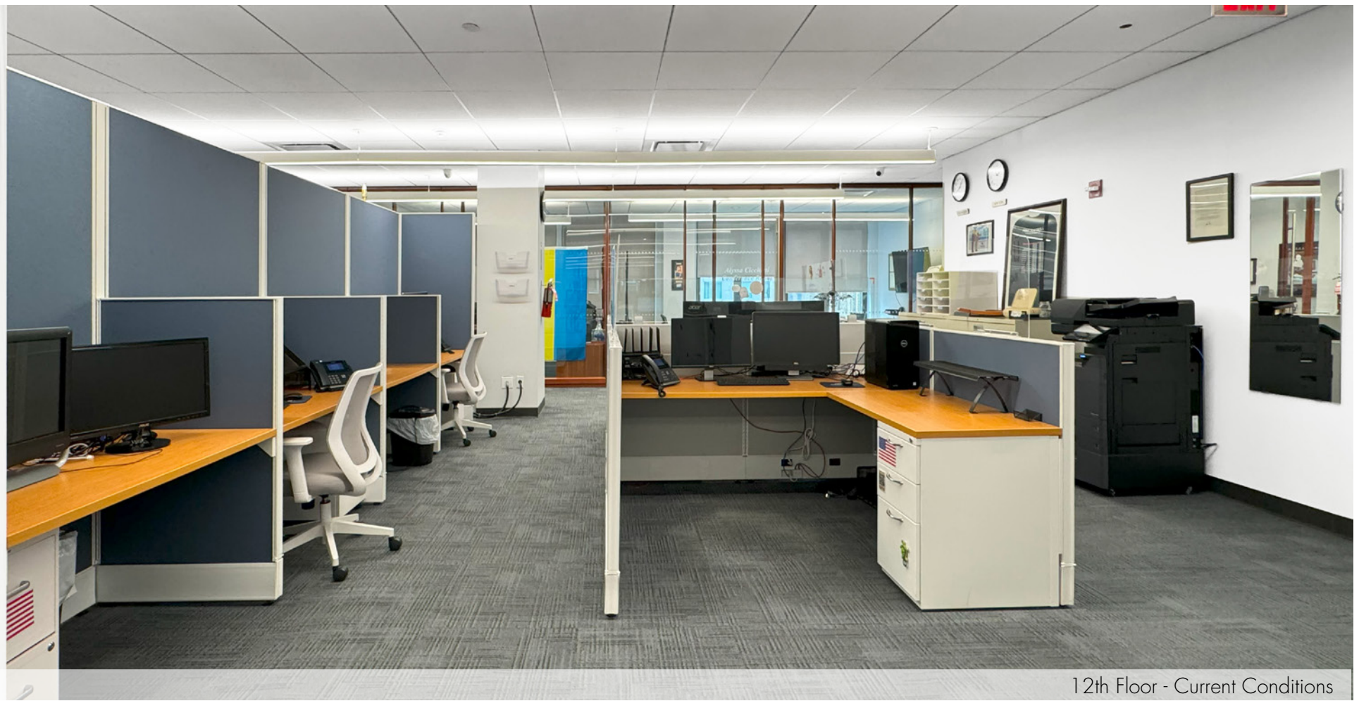
12th Floor - Current Conditions