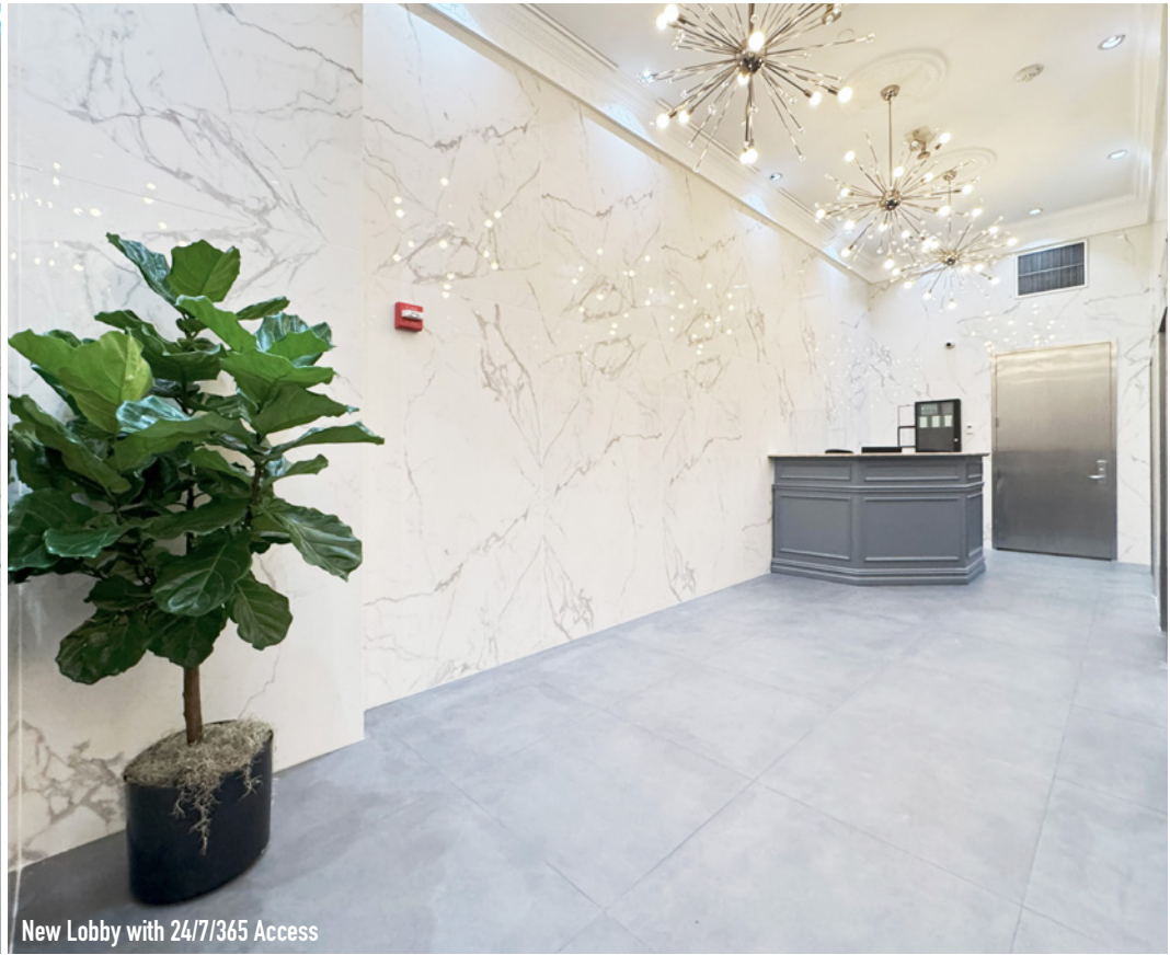
New Lobby with 24/7/365 Access