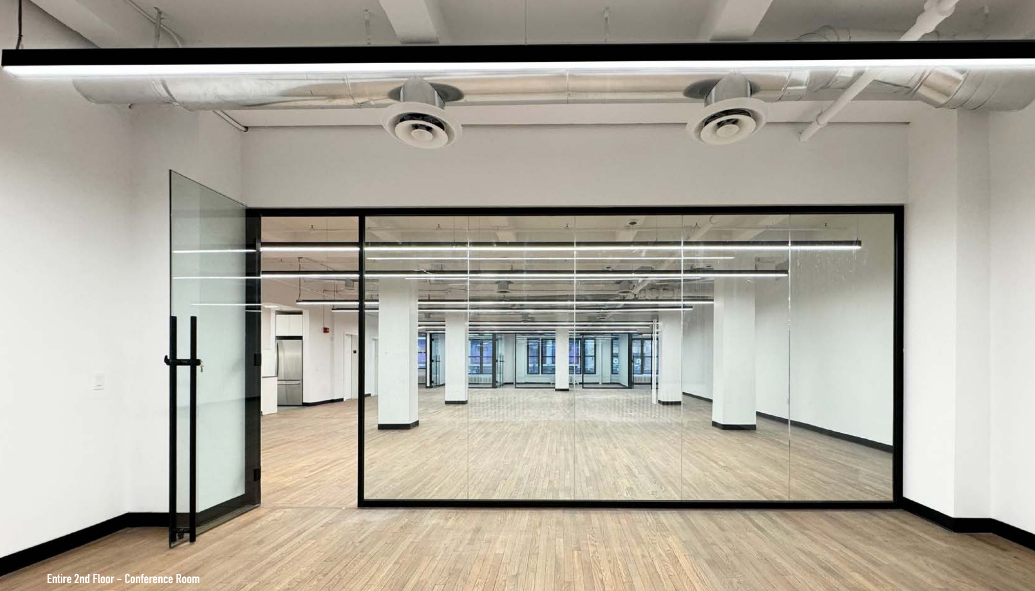
Entire 2nd Floor - Conference Room