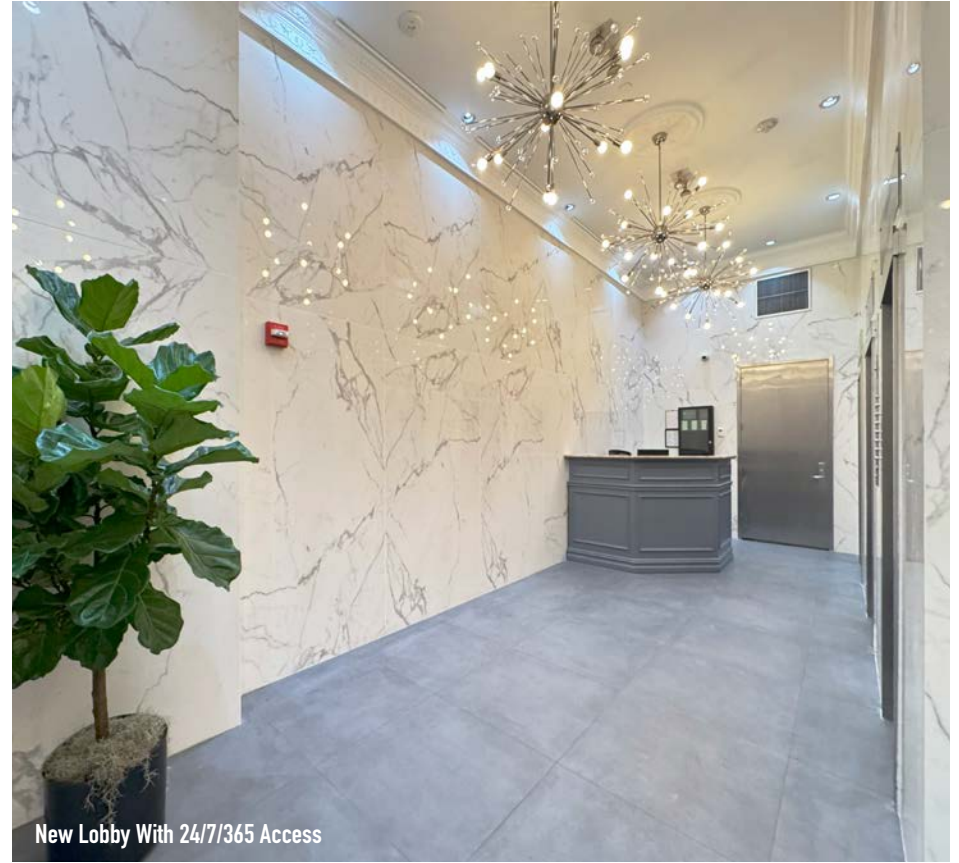
New Lobby With 24/7/365 Access