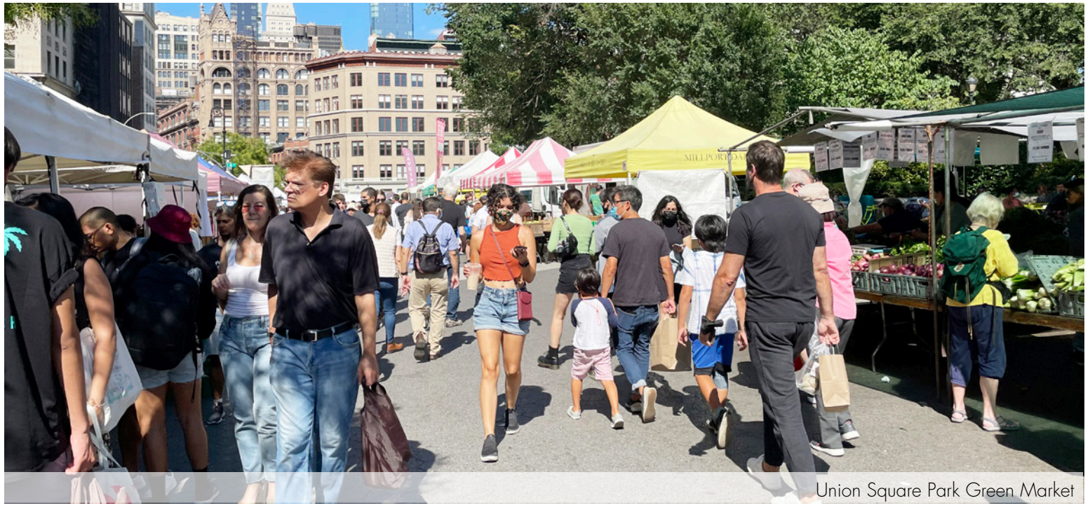
Union Square Park Green Market

Anchoring Union Square Park, 200 Park Avenue South offers tenants a burgeoning submarket full of creative tenancy, direct connectivity to Union Square transit hub's multiple express and local trains, the farmers market, a wide variety on convenient eateries, fitness studios, and a myriad of other work/lifestyle benefits