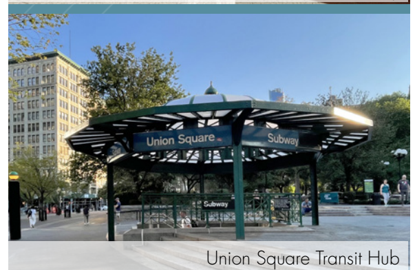
Union Square Transit Hub