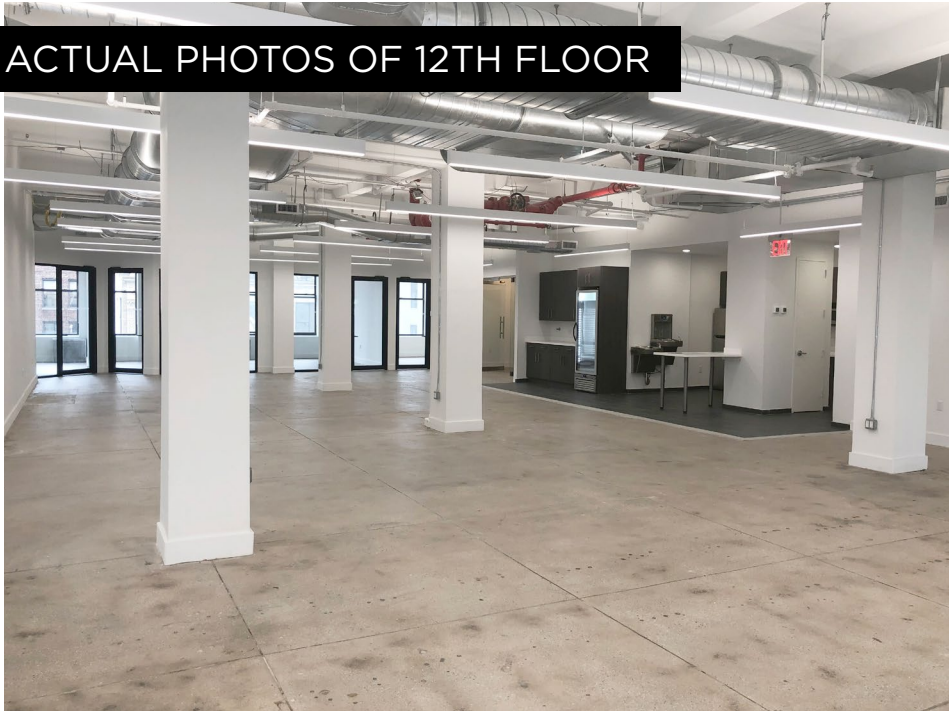
ACTUAL PHOTOS OF 12TH FLOOR