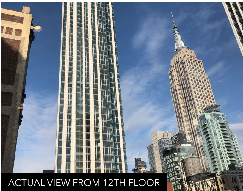
ACTUAL VIEW FROM 12TH FLOOR