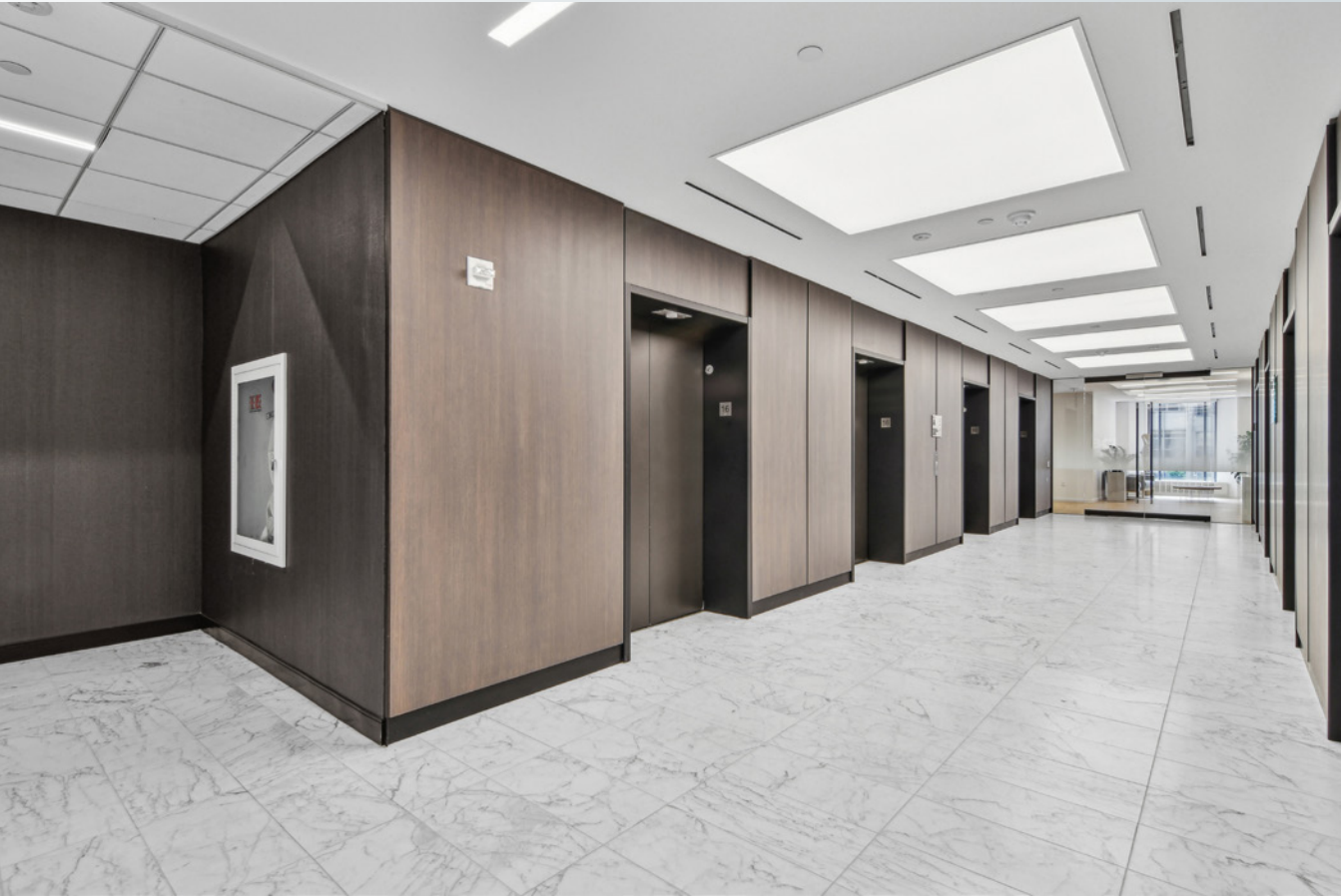
ELEVATOR BANK ►