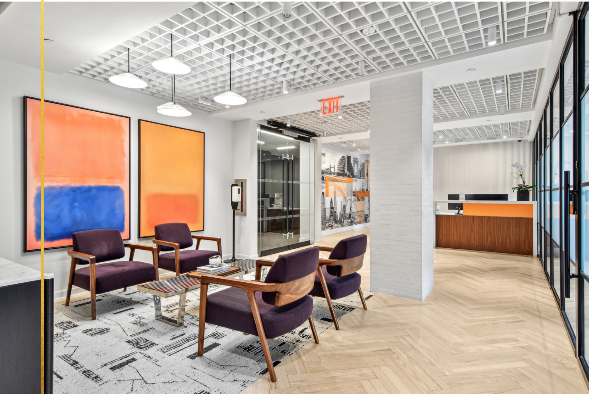
▲ RECEPTION ►