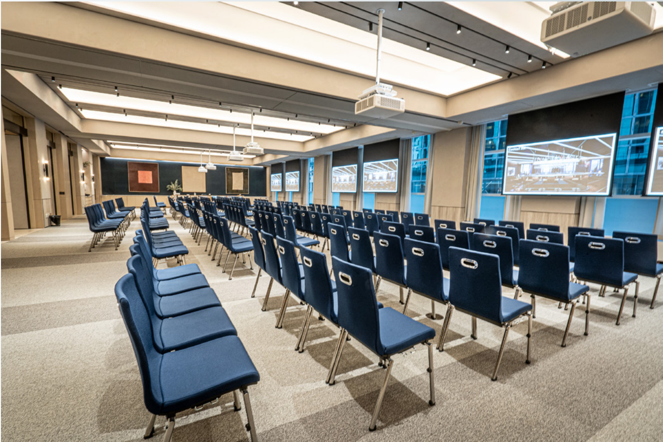
CONFERENCE CENTER ►