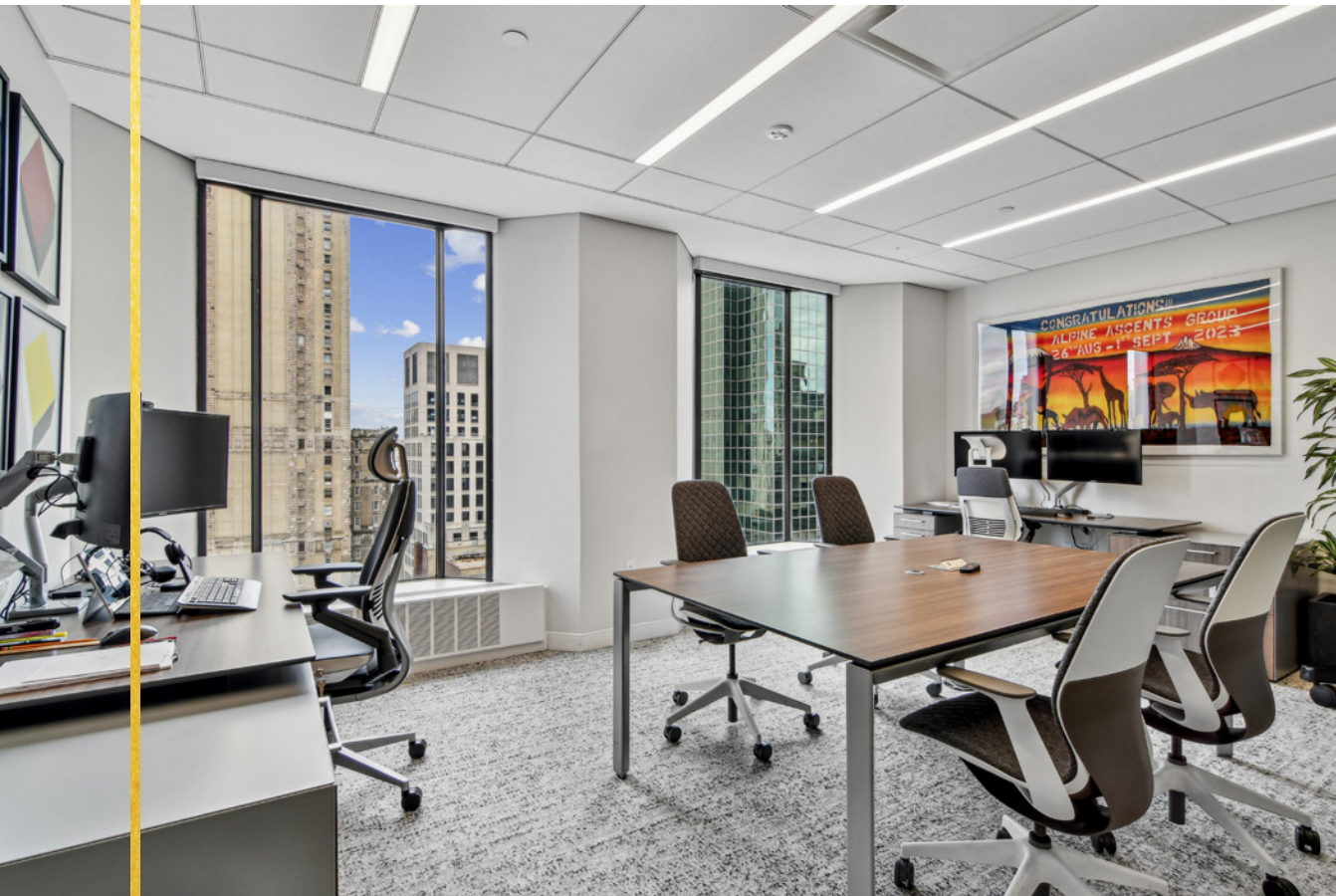
◀ SHARED OFFICE