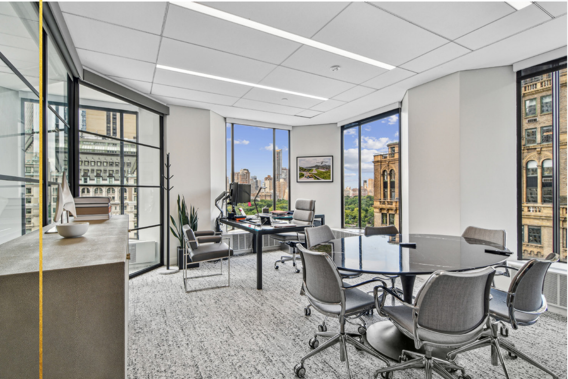
EXECUTIVE OFFICE ▲