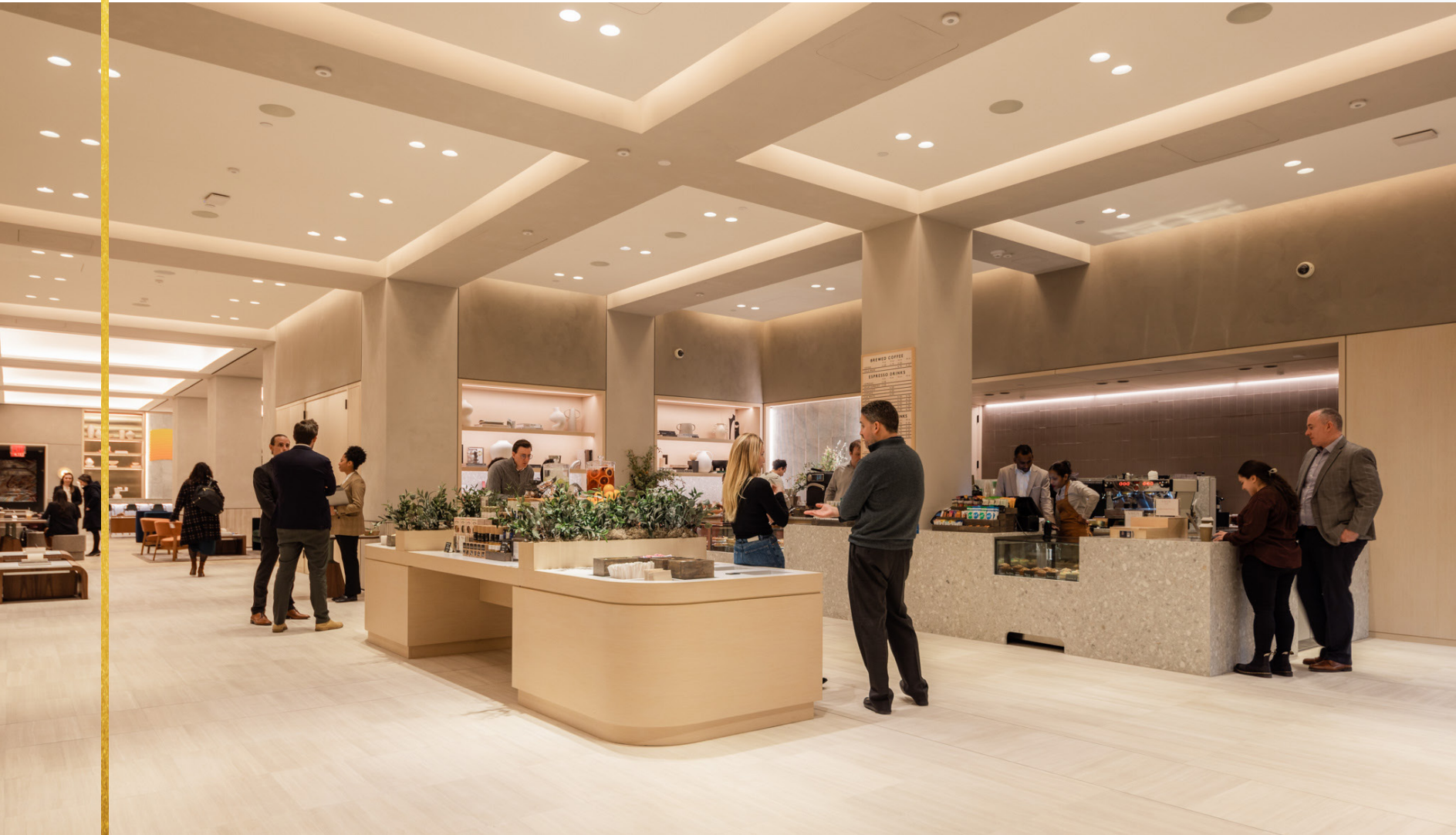
FOOD & BEVERAGE ▲