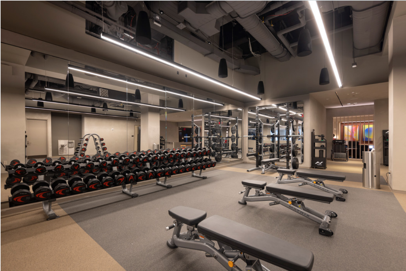
FITNESS & HEALTH CENTER ►

In keeping with the building’s legendary marble façade, the Club was designed around grand architectural gestures and outfitted with a warm, enveloping palette of marble, plaster, and white oak millwork.