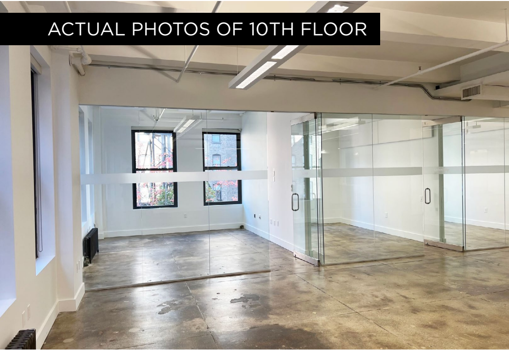
ACTUAL PHOTOS OF 10TH FLOOR