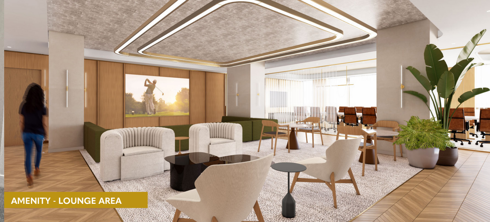
AMENITY - LOUNGE AREA