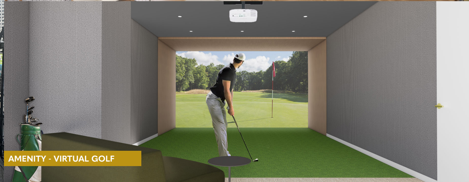
AMENITY - VIRTUAL GOLF