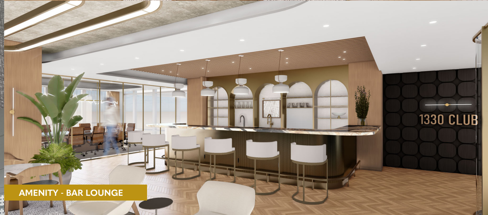
AMENITY - BAR LOUNGE