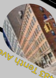
483 Tenth Ave