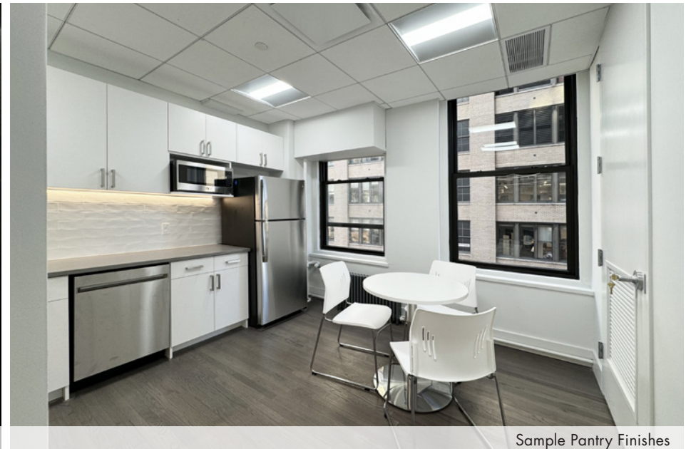
Sample Pantry Finishes