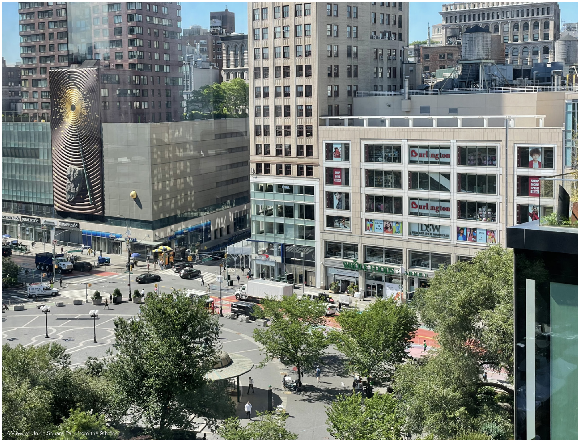
A View of Union Square Park from the 9th floor