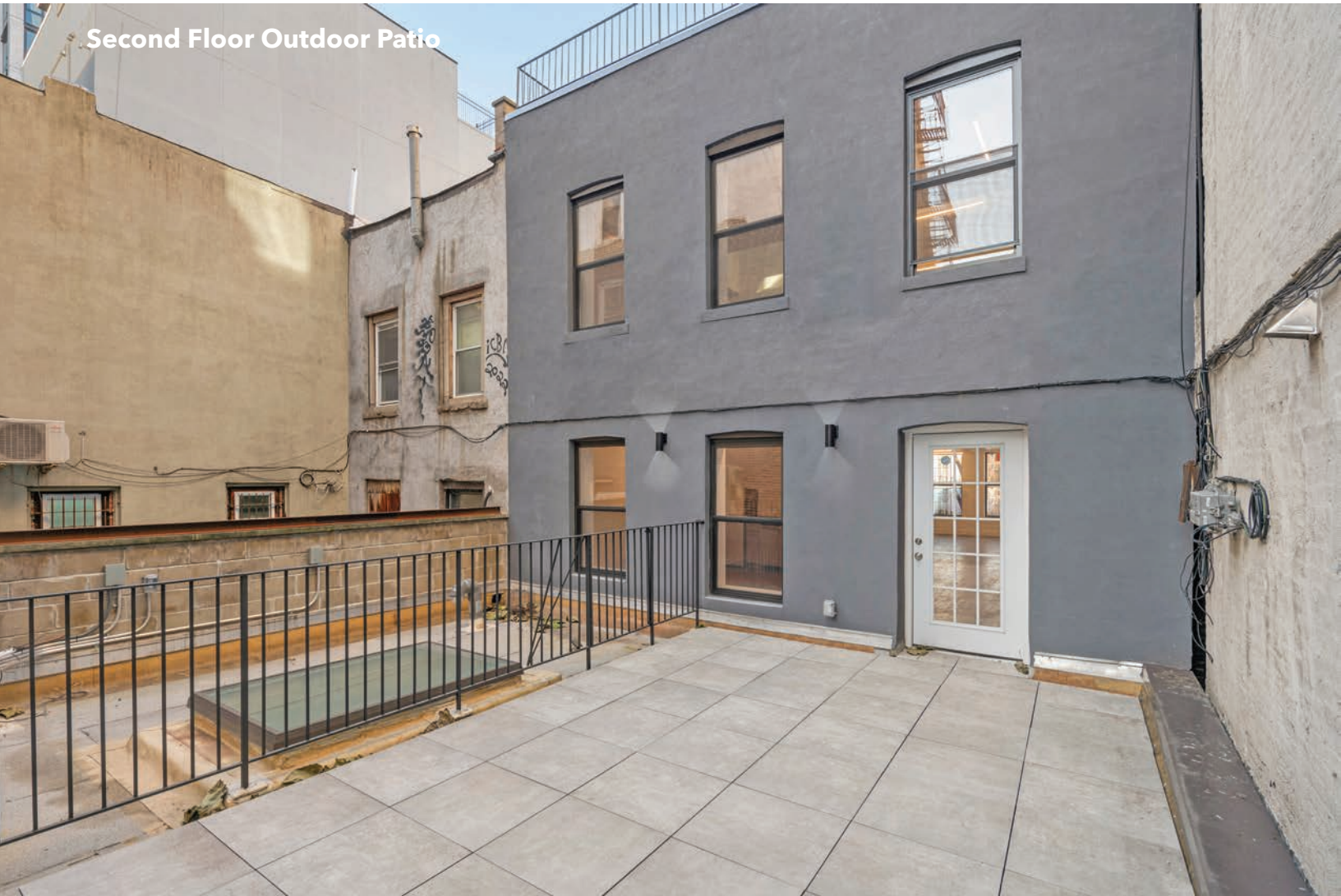
Second Floor Outdoor Patio