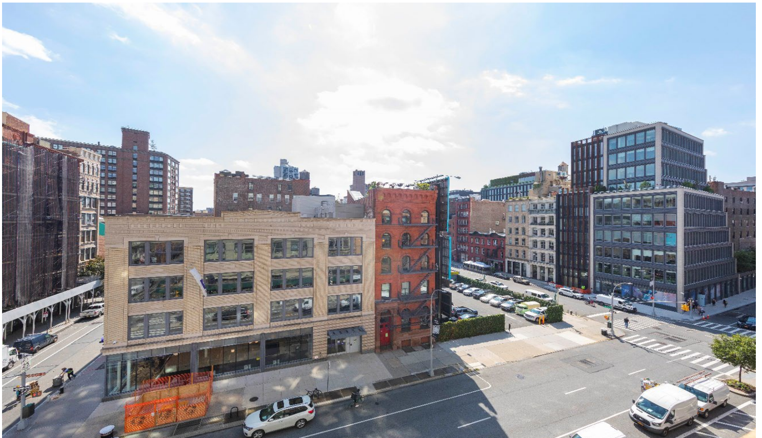
Eastern Light & Views